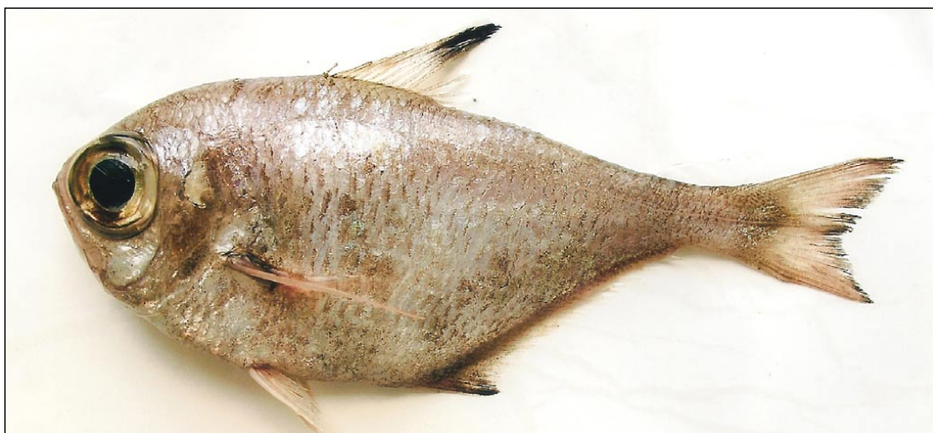
Fig. 4: Pempheris vanicolensis .