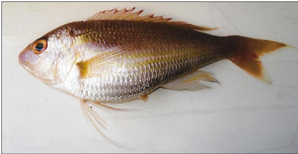
Fig. 3: Nemipterus randalli .

Specimens of this species were first caught off Alexandria at a depth of about 80m in 2008. Additional specimens were later caught