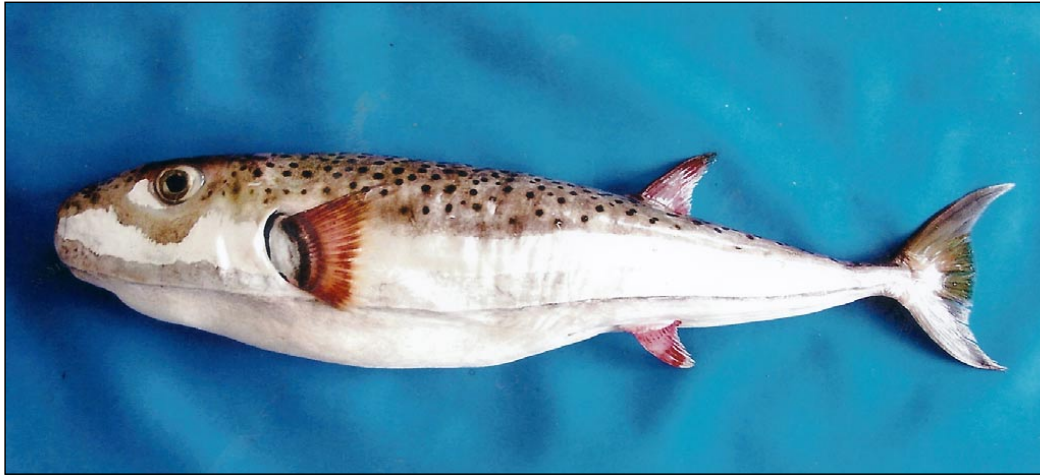
Fig. 5: Lagocephalus sceleratus .