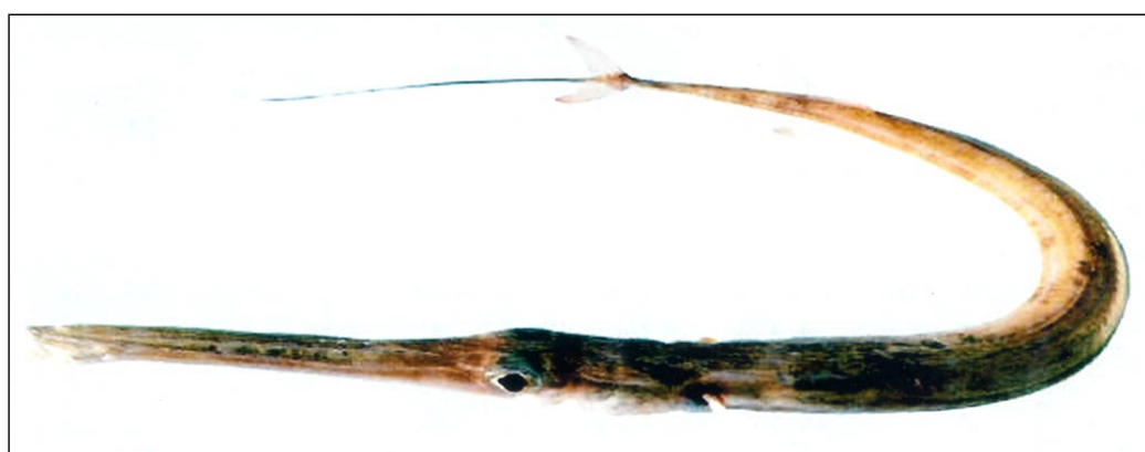
Fig. 2: Fistularia commersonii .