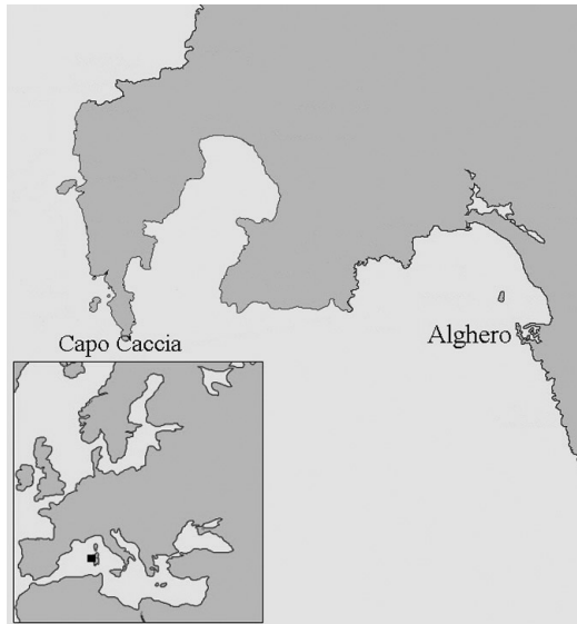
Fig. 1: Capo Caccia (Alghero) 40°33'39"N 8°09'50"E.

and then, on the boat, were cleaned of the rocky bottom on which they grow and put in a bowl. From 2002 to 2005 about 150 kg of red coral colonies have been analyzed and the molluscs on that coral harvested.