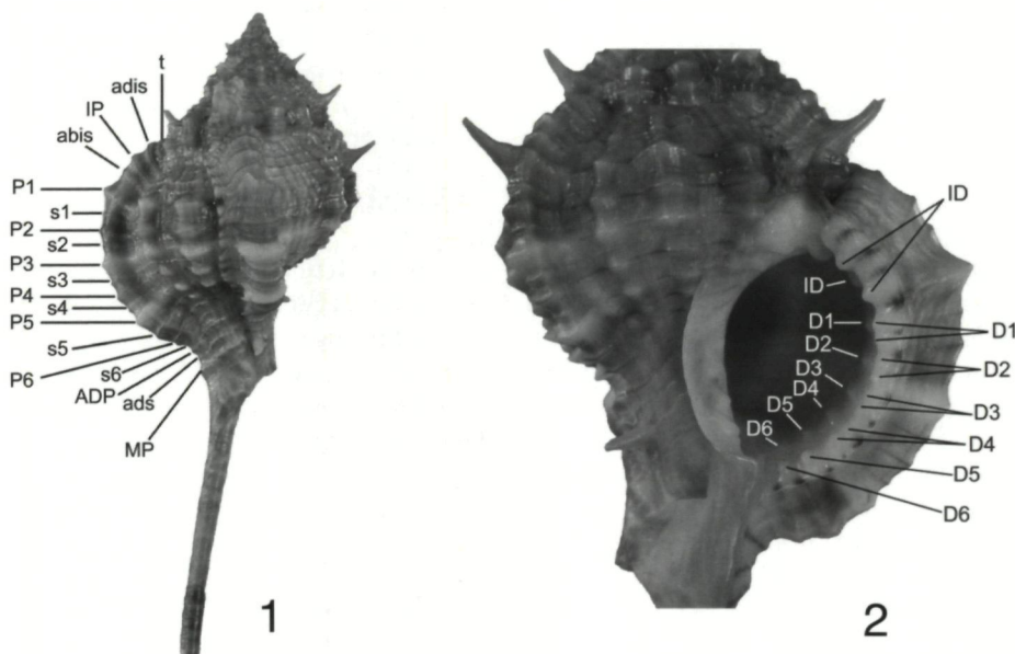
Figs 1-2. Siratus michelae n. sp. spiral cords and apertural denticles morphology (paratype RH coll.).

Etymology. The new species is named for Michèle Colomb, the wife of the second author.