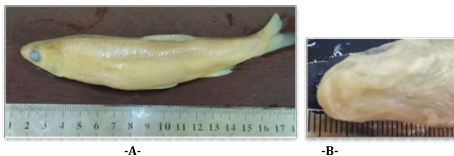
Fig (4): Chondrostoma regium (Heckel, 1843) from Haji Racky, Halabja road. A- Whole body. B- Ventral side of head showing the mouth.

Distribution: this fish found in Orontes, Queiq, Euphrates and the Khabour Rivers, Tigris, Little and Great Zabs, Diyala River, streams, lakes and reservoirs [2; 7].