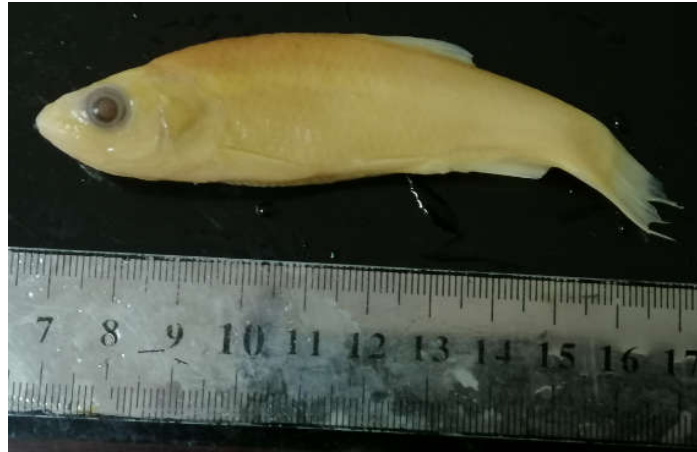
Figure (6): Squalius cephalus (Linnaeus, 1758) from Zalam River, Sayed Sadik.

The differences in morphometric characters between our own fishes in the present study and those of the previous literary data may be attributed to differences in habitat conditions, such as geographical isolation and environmental changes, this consistent with that stated by Colihueque et al. (25) in that fishes are effected largely to environmentally-induced morphological variations. Coad (2) attributed the variation in some fish species, such as in variation of the scale counts in Alburnus mossulensis to the effect of local environmental conditions, also Borkenhagen and Krupp (4) pointed that fragmentation of the distribution area of C. luteus resulted several isolated populations.