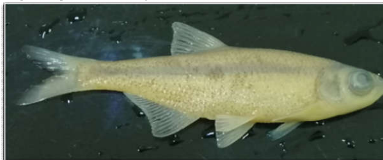
Figure (1): Alburnus caeruleus Heckel, 1843, Haji Racky stream.

Distribution: It found in the Euphrates and Tigris drainages in southern Turkey, Iran and Iraq [10]. In Iraq, it found in the Tigris-Euphrates River systems, southern marshes, streams, dams and lakes [2; 7].