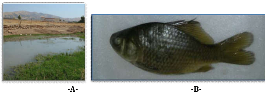
Fig (3): Carassius auratus (Linnaeus, 1758) from Hamawgan fountain A- Hamawgan fountain, Halabja B- Whole body.

Lahonyet al. (20) did not list Carassius auratus within their systematic lists of fauna and flora of Hawraman Mountain, Halabja Province, as they recorded only the five freshwater fish species ( Barbatula panthera ; Chondrostoma maregium ; Capoeta (reported as Varicorhinus ) barroisi ; Caraso barusluteus (reported as Barbusluteus ) and Acanthobra mamarmid ), all these species belonging to the family Cyprinidae. C. auratus appeared in large numbers for the first time in Hamawgan fountain, Halabja after the series of the earthquakes in 2018. To the best of our knowledge, this is the first record for this fish from Halabja.