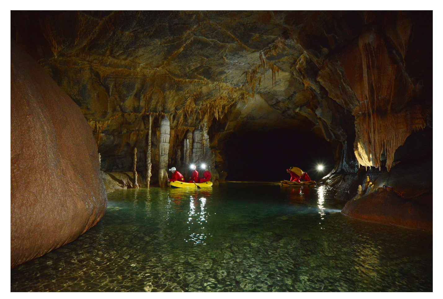
Figure 1. The unique features of Križna jama are its breathtaking clean and emerald green subterranean lakes.