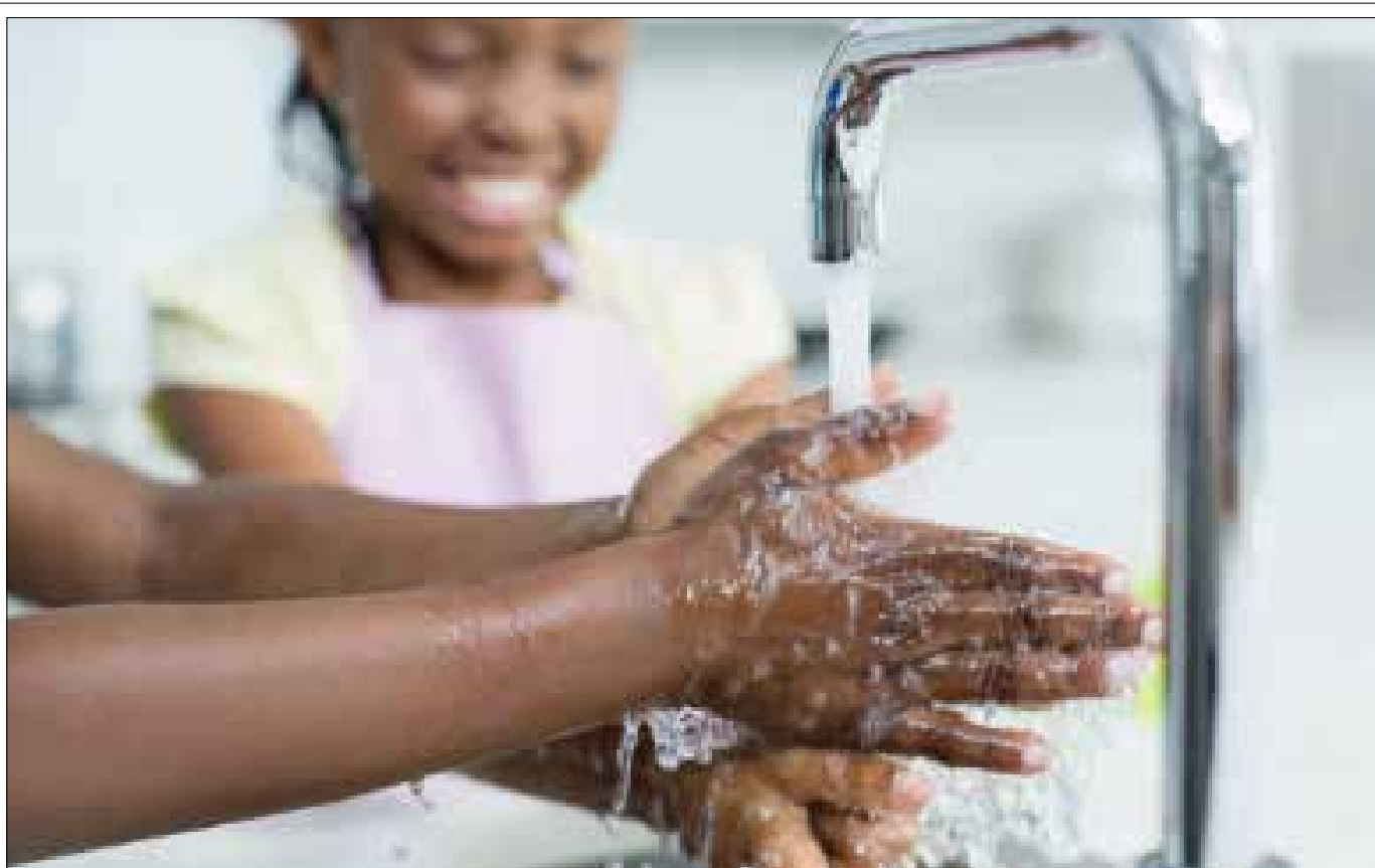
President Cyril Ramaphosa is taking important steps to ensure that the communities of the Waterberg District Municipality receive water and infrastructure projects which are in line with the District Development Model.

President Cyril Ramaphosa has announced R25 billion for infrastructure projects in the Waterberg District Municipality in Limpopo.