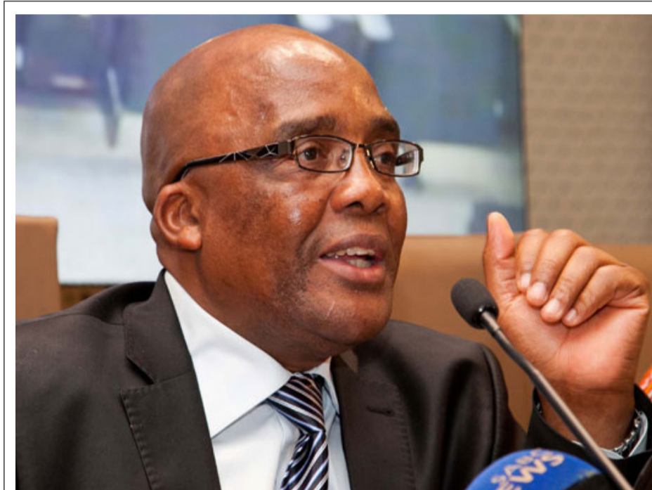
Tona ya Boitekanelo Ngaka Aaron Motsoaledi o itsisitse maano a puso a go lwantsha HIV le AIDS.

“Re tla thankgolola letsholo la dingwaga di le tharo le le lebagang le basetsana le makgarebe, ba ba mo setlhopheng sa dingwaga tse di magareng ga 15-24, le banna ba ba ba tshwaetsang le go ba imisa,” o rialo. Letsholo leno le tla lebagana le dikarolo di