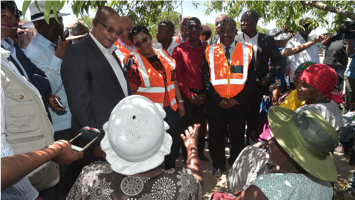
Government has come up with creative ways to improve and ensure that there is constant communication with its citizens.