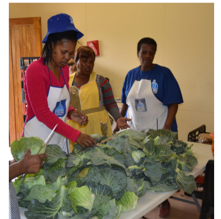
Makgolokgolo a batho a tswetswe mosola ke matsapa a a dirilweng ke Mmasepala wa eThekwini ka go tlamela ka lefelo la go apaya dijo tsa bao ba humanegileng.

Go tlamela ka dintlo, ditirelo tsa motheo le tsa loago go tsamaelana le go tlhola bodulo jwa leruri jwa batho,” o rialo.