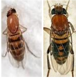
Figure 3: Female and Male adult Megaselia scalaris flies