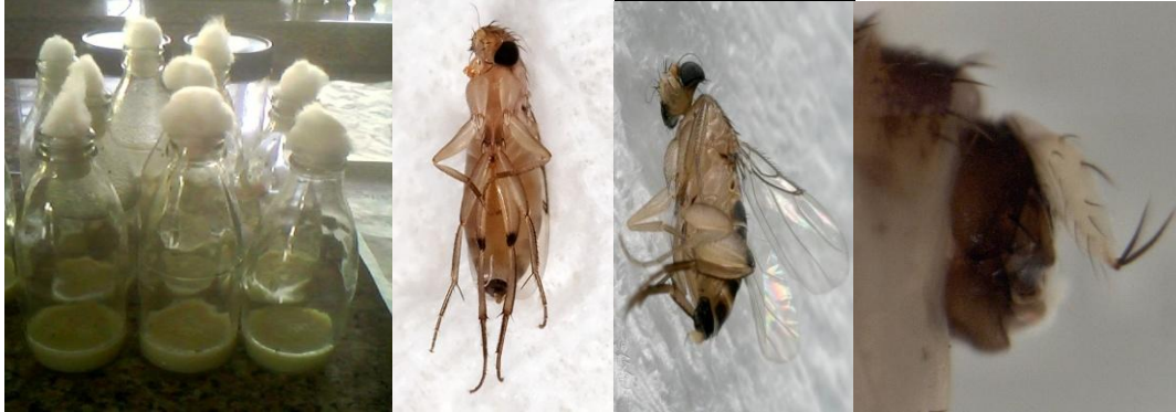
Figure 5: Breeding Megaselia scalaris

Ratcliffe 1994; Grassberger et al. 2003; Grassberger & Reiter 2001). However, the use of decomposing animal tissues often brings unpleasant odour and unsterile (Sherman & Tran 1995). Sucrose dextrose medium and maltose corn medium. The composition of the food predominantly includes sugar, yeast extract, dextrose and corn flour. They can be bred in glass or culturing bottles to obtain large numbers of the progeny (Fig. 5). And most often crosses and experiments are set up in glass vials.