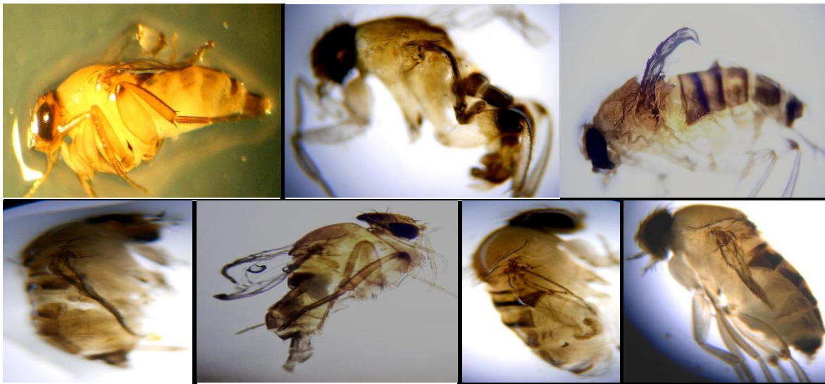
Figure 6: Megaselia scalaris wing mutants

We present here the first report of M. scalaris wing mutants. While working in the lab with M. scalaris various wing mutants were isolated like vestigial wing, wave wing, curly wing, hook wing, which resembled the wing mutants of Drosophila melanogaster (Fig.6).