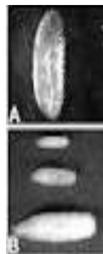
Fig.2 (a) Egg, (b) All larval instars