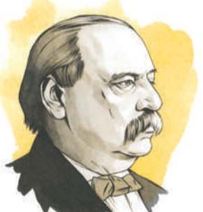
22nd, 24th: Grover Cleveland

Had the first elevator installed in the White House