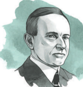
30th: Calvin Coolidge

Had the largest shoe size of any president: 14