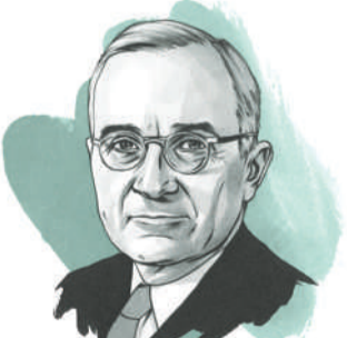
33rd: Harry S. Truman

No president will ever serve as long as he did