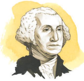
1st: George Washington

in February.) So here is KidsPost’s tribute to the presidents. We can think of endless games you can play while studying this page. Who had the longest name ? Who had the shortest ? How many presidents had beards ? How many wore glasses ? (See, the fun never ends!) To find out more about each president and their inaugural speeches, go to www.kidspost.com .