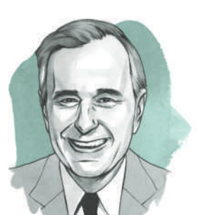
41st: George H.W. Bush

Acted in movies before becoming president