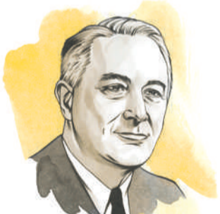
32nd: Franklin D. Roosevelt