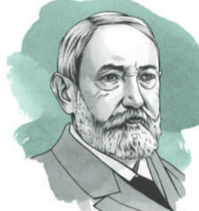
23rd: Benjamin Harrison

Only president to serve two terms not in a row