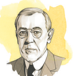
28th: Woodrow Wilson

Only president to become a Supreme Court justice after leaving office