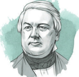
13th: Millard Fillmore

First voted in 1848, when he was 62 years old