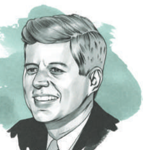
35th: John F. Kennedy

First president of all 50 states (Alaska and Hawaii were new)