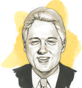
42nd: Bill Clinton