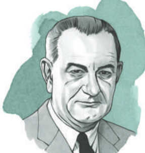
36th: Lyndon B. Johnson