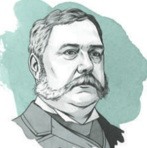
21st: Chester A. Arthur