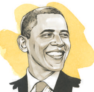
44th: Barack Obama

Second president to also be the son of a president (J.Q. Adams was first)