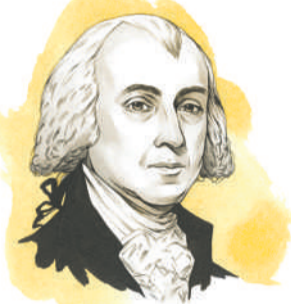
4th: James Madison

Tried to assemble a mastodon skeleton in the White House