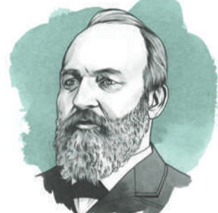
20th: James A. Garfield

Hosted first White House Easter Egg Roll