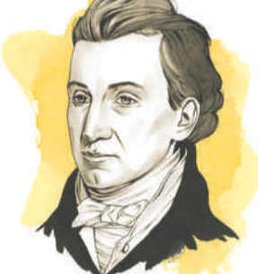
5th: James Monroe

Shortest U.S. president at 5 feet 4 inches