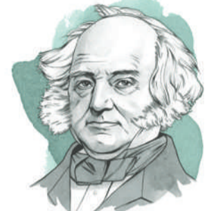
8th: Martin Van Buren

Invited public to the White House for inaugural ball