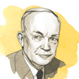
34th: Dwight D. Eisenhower

First president to be sworn in on television