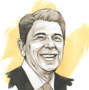
40th: Ronald Reagan

Was a peanut farmer before running for president