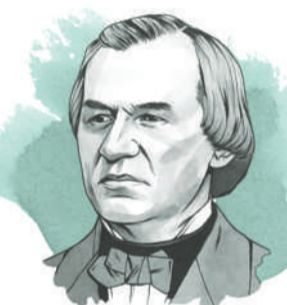
17th: Andrew Johnson

His son Willie is the only child to die in the White House