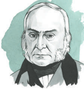
6th: John Quincy Adams

Died on July 4 (as did John Adams and Jefferson)