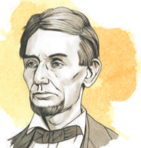
16th: Abraham Lincoln