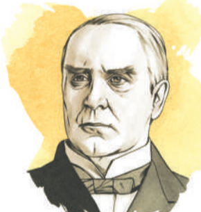
25th: William McKinley

First president to have a Christmas tree in the White House