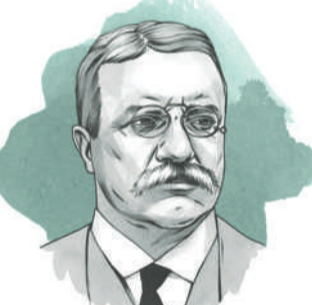
26th: Theodore Roosevelt