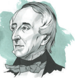
10th: John Tyler