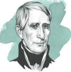
9th: William Henry Harrison

First president to be born a U.S. citizen