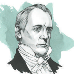
15th: James Buchanan