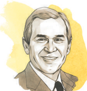
43rd: George W. Bush

First president to have an e-mail address