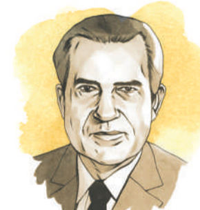
37th: Richard M. Nixon

Only president to be sworn in by a woman