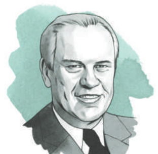
38th: Gerald R. Ford

First president to speak to a man on the moon