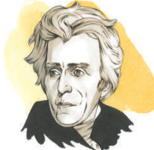
7th: Andrew Jackson

Kept an alligator in the White House for several months