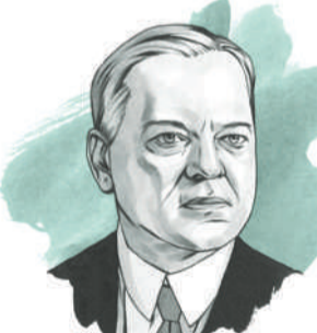
31st: Herbert C. Hoover

Only president born on the Fourth of July