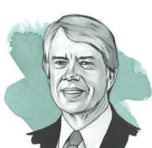
39th: Jimmy Carter

First president to have been an Eagle Scout