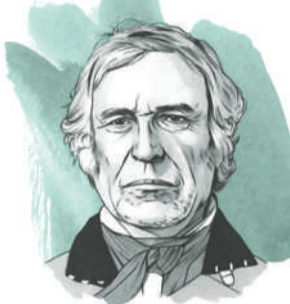
12th: Zachary Taylor

Signed law creating the Smithsonian Institution