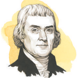
3rd: Thomas Jefferson