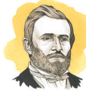
18th: Ulysses S. Grant

Congress tried to remove him from office