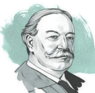
27th: William Howard Taft