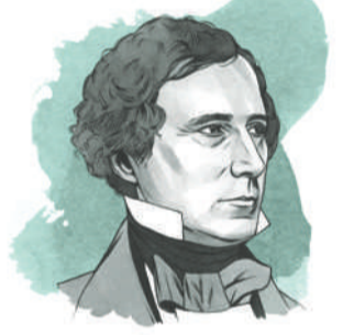
14th: Franklin Pierce