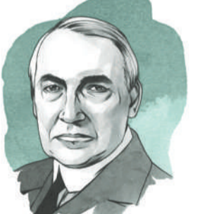
29th: Warren G. Harding

Signed the law giving women the right to vote