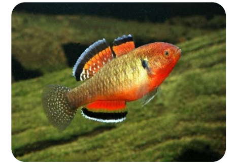
Empire gudgeon

Ongoing maintenance ensures weirs are operating efficiently and safely.