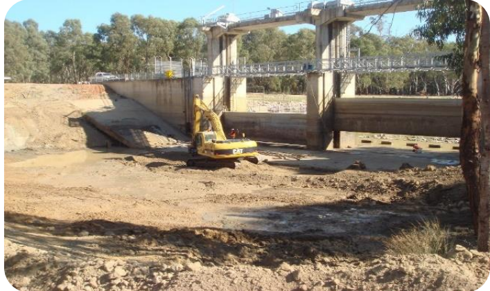
WaterNSW completing maintenance on Yanco Weir.