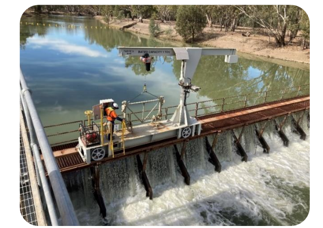
Balranald Weir

A weir is a small barrier built across a stream or river to control and raise the water level slightly on the upstream side, essentially a small-scale dam.