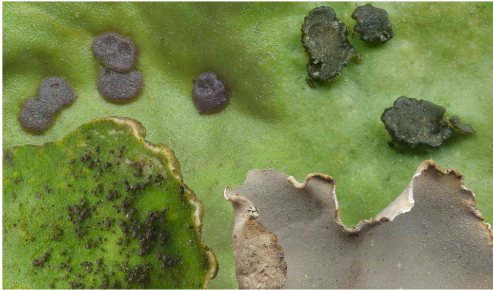
Figure 1. How many lichen species do you see? Three? Four? Five? Clockwise from top left: 1A: Snow Pelt (fungal partner: Peltigera chionophila ) with appressed, non-detachable cephalodia; 1B: Deciduous Pelt (f.p.: P. britannica ), with loose, detachable cephalodia; 1C: lobe of Apple Pelt (f.p.: P. malacea ); and 1D: lobe of Deciduous Pelt, sprinkled with tiny, unexpanded thalli of Panther Pelt (f.p.: P. britannica ). Note: 1A and 1B are much enlarged.

TREVOR GOWARD Enrichened Consulting Ltd., Edgewood Blue, Box 131, Clearwater, BC, Canada V0E 1N0 email: tgoward@interchange.ubc.ca