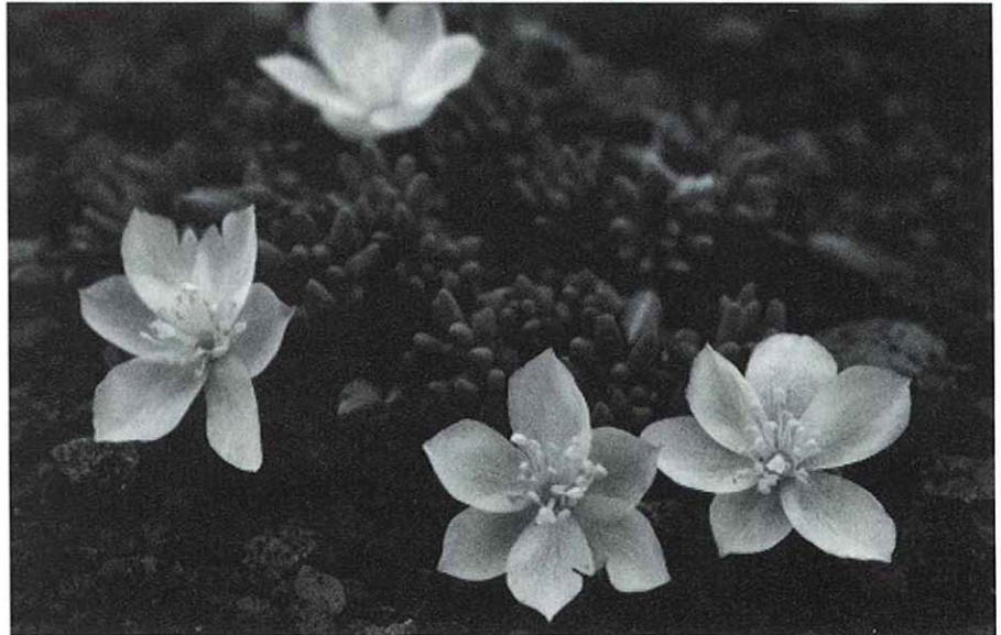
Figure 3. Each of the Fameflower's blossoms is about 1 cm across

Following flowering, the fruits mature to a three-cleft capsule which dehisces vertically, releasing approximately 15 to 25 black, kidney-shaped seeds. The seeds, about 1 mm in length, possess no obvious specialized adaptation for dispersal, and are probably scattered mechanically by wind action. However, Gregson (1987) has noted that the seeds may sometimes be carried away by roving ants. At any rate, the first seeds are ripe by early June, possibly late May in some years. By the first or second week of August, the leaves have withered and fallen, and the Fameflower becomes difficult to locate until the following spring.