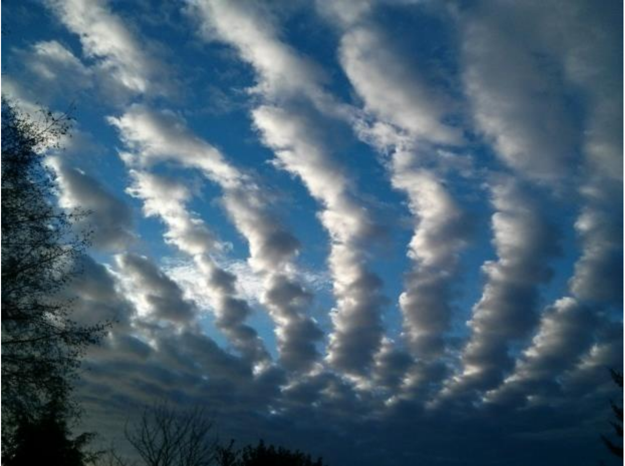
Morning cloud streets over Vancouver Island. Image via CTV News Vancouver Island .