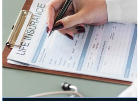
Healthcare (see page 7)