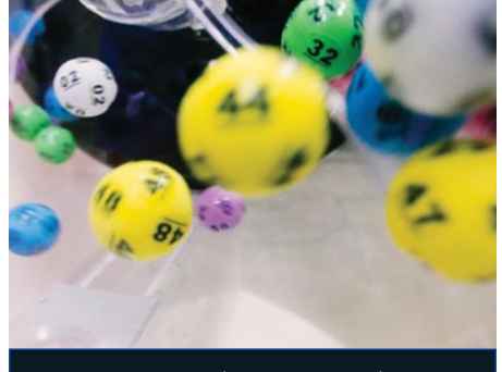
Lottery (see page 11)