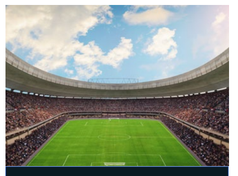
Stadium (see page 7)