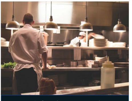
Kitchen (see page 10)