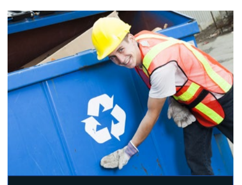
Scrap & Recycling (see page 8)