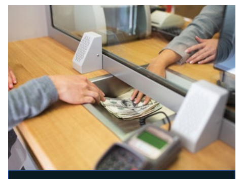
Banking (see page 7)