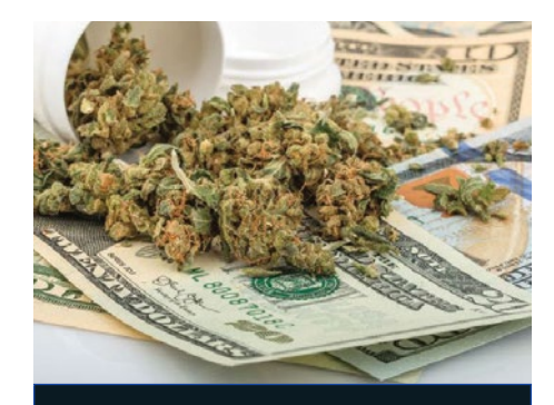
Cannabis (see page 6)