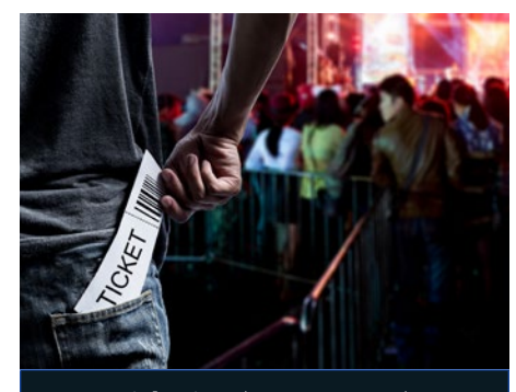
Ticketing (see page 10)