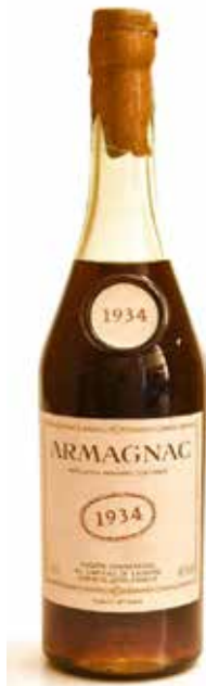
Chateau de Laubade Armagnac 1934 0,7 l Armagnac