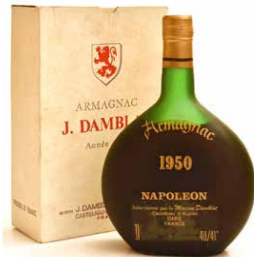
Damblat Armagnac Napoleon Selectionne Castalnaud'Auzan 1950 0,7 l Armagnac