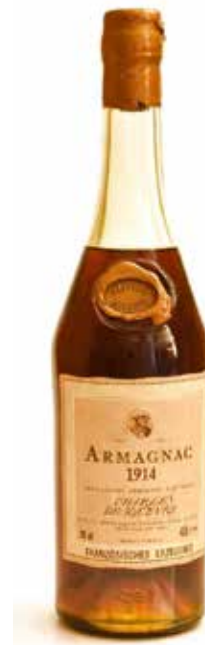
De Squeyre, Charles Armagnac 1914 0,7 l Armagnac