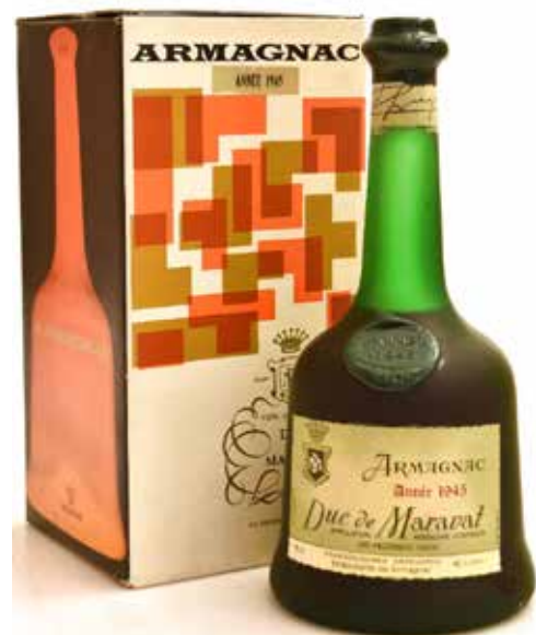
Duc de Maravat Armagnac 1945 0,7 l Armagnac