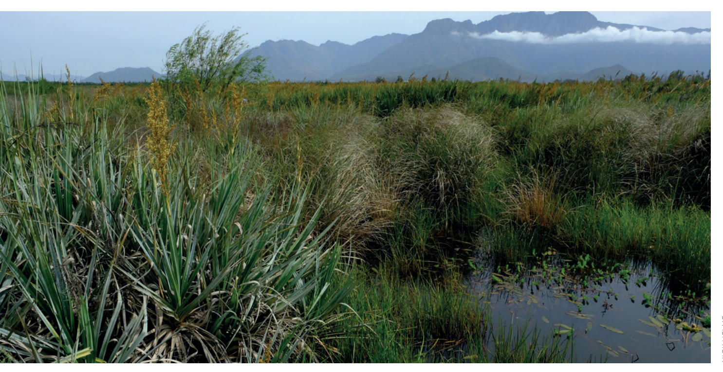
Walking through dense palmiet stands and two-metre deep channels proves challenging.