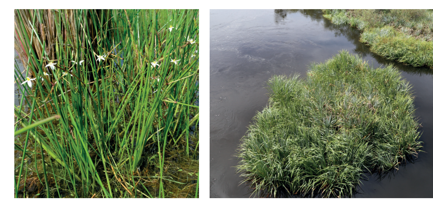
(Above left) watersterretjie (Pauridia aquatica) and (right) palmiet (Prionium serratum).

In the wet channel also is narrowleaf waterblommetjie ( Aponogeton angustifolius ). Local people collect it and the larger A. distachyos to sell as the key ingredient of waterblommetjie bredie.