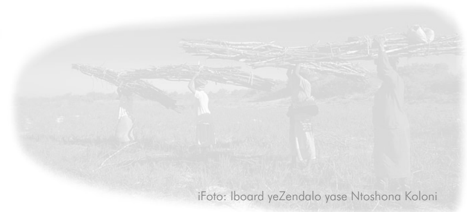
iFoto: Iboard yeZendalo yase Ntshona Koloni

* Okqulethwe yile mali yimali engange R328 000 ebuyiselwe yihodi yoLondolozo lweNdalo eNtshona Kolonihlawu, ibonisa okushiyekileyo kwimali eyayisisahlulo sokuhlangahlengisa iBhodi engazange isetyenziswe kwakunye nemali engange R45 000 yamaphepha mvume okusetyenziswa kwamaphenyane kwiindawo ezithile. Ukunika amaphepha mvume eendawo zokusebenzisa amaphenyane yaqaliswa esizweni ngo Decemba 2003.