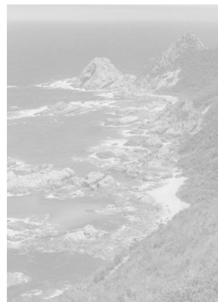
Umhlaba woNxweme eNtshona Koloni.

ukuyoku tshintshiselana ngolwazi locebo lomhlaba nezinto zentlalo neengxoxo ezingephulo lemfundo elizakufumana ukhulo kwezogqosho olunokubakho kwiidolophu zeNtshona Koloni. Kwakhona ukubandanyeka nokuthatha inxaxheba kwi nkqubo yokwenza ntsha iidolophu (iKhayelitsha ne Mitchell's Plain) neNkqubo edibeneyo yokuPhuhlisa amaphandle. (uMbindi weKaroo) Imali engange sigidi esinesiqingatha seerandi ifakiwe kwezi nkqubo zimbini ukwenzela amaphulo achaphazela umhlaba.