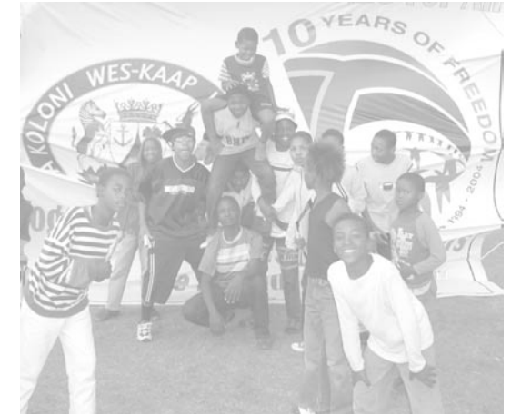
KwimiNyaka eliShumi yeDemokhrasi uLuntu luyaGcoba

Le nkqutyana yajonga ekunikeni inkonzo yokuphatha abantu echubekileyo nesebenzayo kubantu bonke, iquke kwanenkono yokusebenzela eyinika iSebe leMicimbi yeNkcubeko nezeMidlalo.