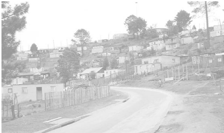
Ukwanda kwama Tyotyombe aseKnysna.

Umthetho wokuCeba noPhuhliso eNtshonaKoloni ka 1999 (Umthetho 7 ka 1999) wabhengezwa ngo April 1999. Ukusabela kwigalelo loomasipala, nokuyondelelanisa umthetho nemithetho emitsha efana kuRhulumente weNdawo: uMthetho weeNkqubo zikaMasipala 2000 (Umthetho 32 ka 2000), iPhepha leSaziso eliLungisiweyo lokuCeba noPhuhliso eNtshona Koloni layilwa. IPhepha leSaziso langeniswa kwiKomiti eMisiweyo yoRhulumente weNdawo nakwiSebe loBume beNdawo nokuCeba uPhuhliso ngo Novemba 2003. Okwa ngoku iKomiti eMisiweyo ayikenzi ziphakamiso malunga nalo mthetho. Ukubhengezwa kwePhepha leSaziso ngekwanceda iSebe ukuba liwusebenzise lo mthetho, ngekwanceda ekwenzeni izicamango zokuceba nendawo zibe nxamnye noMgaqo Siseko ka 1996.