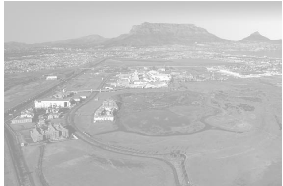
iFoto le"Intaka Island Wetlands" eCentury City. Lena yindawo yezendaco bku thiwa yi "wetland". Eya zuza uku phumelela kwa khuphiswano yindawo engange 8 ha. Ekuthiwa yi "ecological sensitive ephemeral" ezezinye ezimbalwa indawo elizweni ezishiyekileyo.

Ukwengeza kwezi workshop zokwakhana zikhankanyiweyo ngaphezulu eli candelo licwangcise iworkshop yephondo engezivumelwano zokusebenzisana nokuphathwa kwendalo yeDEAT, kunye nenye iworkshop yendalo nokucwangcisa yabaphathi kwibhodi yoLondolozo lwendalo eNtshona Koloni. Iworkshop yokusingqongileyo nobume bomthetho wocwangciso kwezendalo yabanjwa yenzelwa abacebisi kucwangciso lwendalo, kwasekuqaleni kwethuba lokwenza ingxelo.