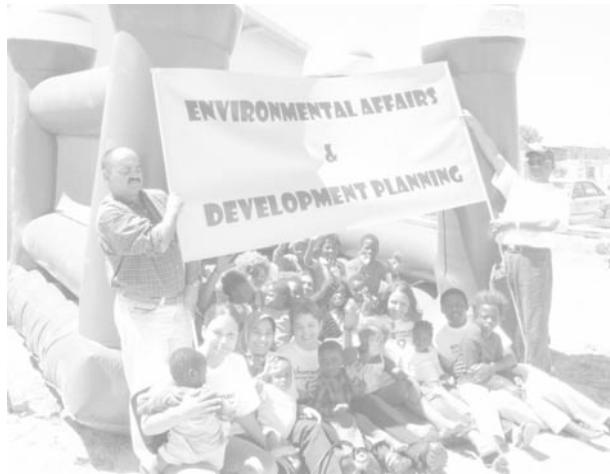
Ubhiyozo lweWorld Aids Day, abasebenzi beSebe bacitha a mini nabantwana baseNobanda Day Care Centre eKhayelitsha.

* Ukulandela isicelo soVimba weMali wePhondo sokunyanzelisa uqoqosho kuze luhlangulwe ingcinezelo kuhlalo mali lwePhondo kulo nyaka sithetha ngawo, imali engangeR3,0 million yabhengezwa njengemali eqoqoshe ngesinyanzelo ukuba ngoko imali leyo iyakukhululelwa iSebe liyisebenzise kunyaka mali lowo.