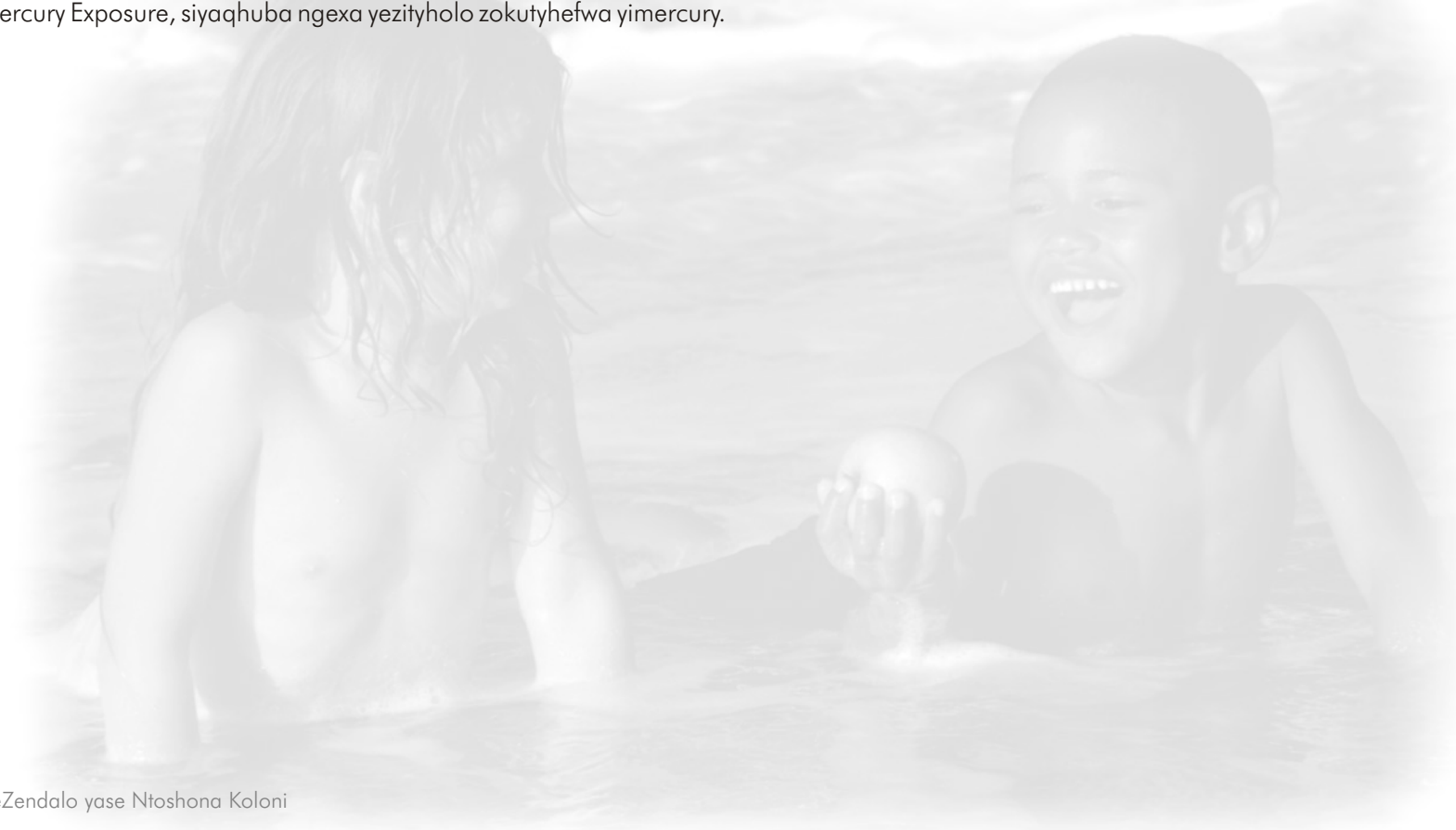
iFoto: Iboard yeZendalo yase Ntoshona Koloni

ukuba lifanele ukuba kweliSebe okanye hayi. Eli bakala libalulekile kulawulo lwenkunkuma kunye nongcoliseko kwaye inyanzelisa ukuphatha ngokusebenzisana. Ngamanye amaxesha ukwaphulwa komthetho akuzange sikwazi ukukhalaza mayela nemithetho emininzi, ukunyanzeliswa kokusebenza korhulumente wangaphakathi kwenziwa. Umzekelo kukuvalwa kwendawo ese Somerset West , eyenza ngenjongo zokuphinda isetyenziswe ioyile yokupheka. Kwezi ndlela Ukusebenza korhulumente wangaphakathi, apho oludweliso nkqubo lwadlala okanye ludlala indima ebonakalayo, iyabandakanyeka iSealand Express yenqanawa yentlekele kunye nezehlo eziqhubekayo zokutyhefwa kwe metyuri kummandla weVssershok. Amanyathelo karhulumente wangaphakathi, njengeBiological Monitoring yeziFundo zeMercury Exposure, siyaqhuba ngexa yezityholo zokutyhefwa yimercury.