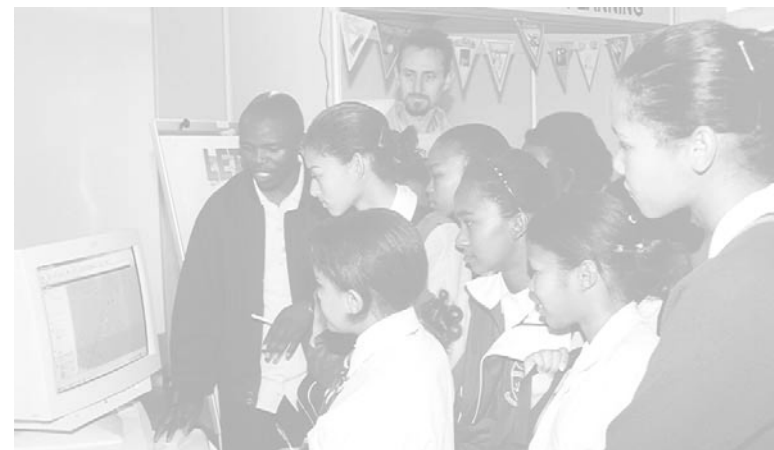
Abafundi batyelele iGIS open day eCentury City.

Ipolisi yoLawulo lweeNdawo zoNxweme eNtshona Koloni yagqitywa yakwilungelo lokungeniswa kwiKhabhinethi ivunywe ekuqaleni kuka 2003. Kodwa ke kuthe kwakuyilwa iiKomiti zeMbumba, kwagqitywa ukuba umbhalo wePolisi mawungeniiswe kuqala kwiiKomiti zeMbumba phambi kokuba iye kwiKhabhinethi. Ngokwengcebiso zeeKomiti zeMbumba kwabakho iindawo