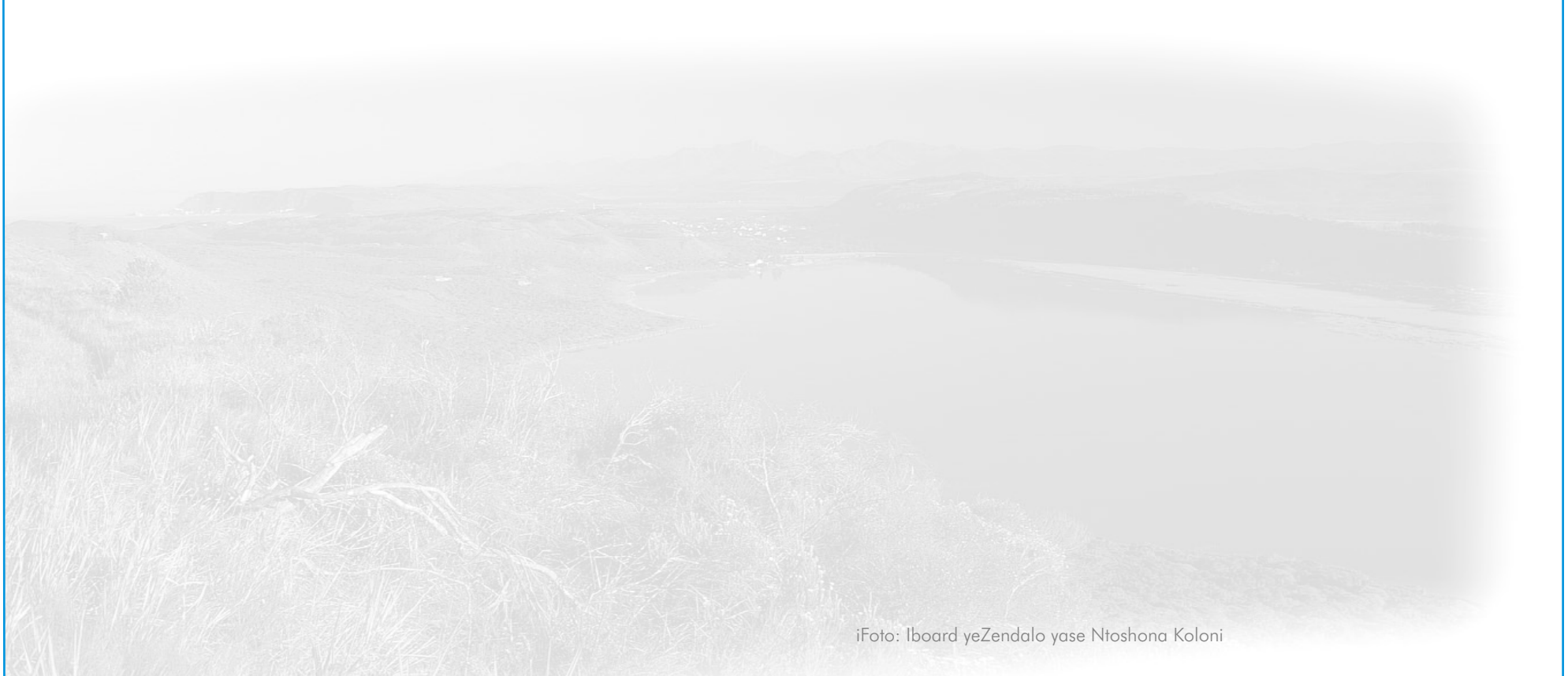
iFoto: Iboard yeZendalo yase Ntoshona Koloni

Le nkqubo ngenxa yenxaxheba yayo kubalo nakwezinye izinto zesistatistikha ingathathwa njengomniki obalulekileyo kwistatistiki nguRhulumente wePhondo. Kulo nyaka uphelileyo isebe lestatistiki lihambise amaphepha ayi 113, zaze ezinye ingxelo eziyi 62 zasiwa kulenkqubo.