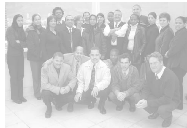
IQhela Lezomnotho iEA & DP.

Isebe kwakunye neSebe leMicimbi yeNkcubeko nezeMidlalo, iKomishini yeNkcubeko eNtshona Koloni neKomiti yezeLwimi eNtshona Koloni zafumana iingxelo zophononongo ezingenagxeke ngonyaka mali ka 2002/03 .