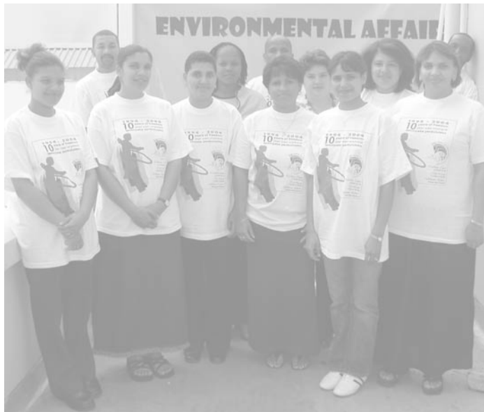
Abasebenzi beSebe bonwabela uSuku lwamaLungelo oLuntu.