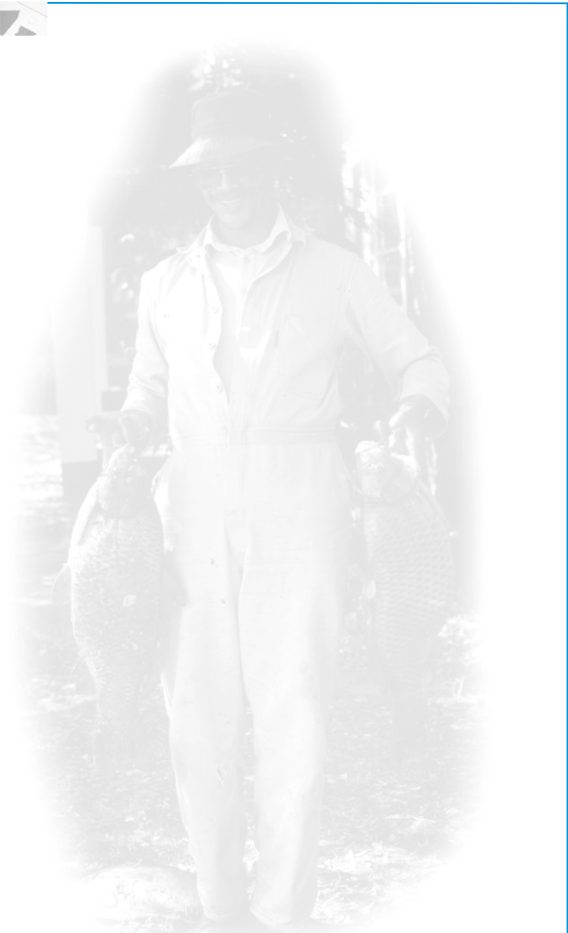
iFoto: Iboard yeZendalo yase Ntshona Koloni