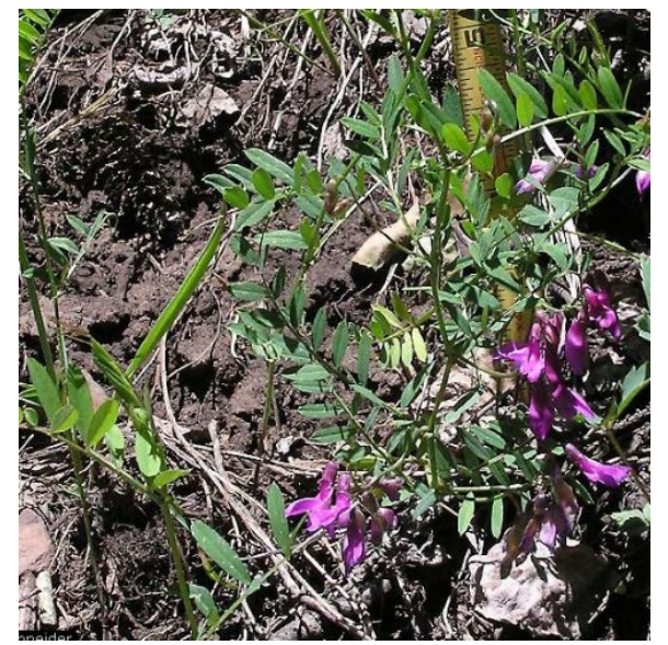
American vetch.

Vicia americana Muhl. ex Willd. Symbol =VIAM