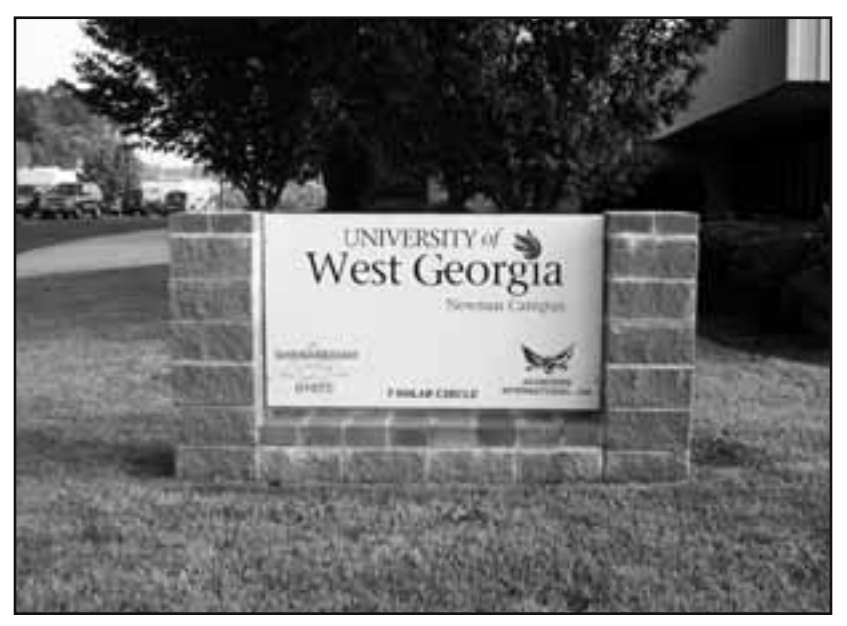
The University of West Georgia offers both undergraduate and graduate courses at its Newnan Center.

The requirements for admission to the Newnan Center are the same as admission to the University on its Carrollton campus. Applicants for admission should consult the "Admissions" section in this catalog and the particular requirements of the degree program for which they are applying.