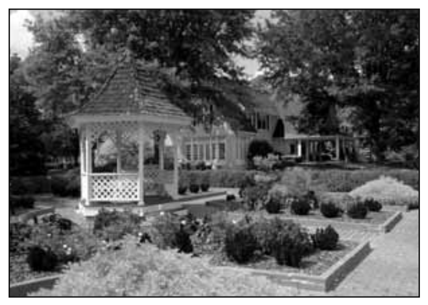
Victory Garden at the Alumni House.

A student whose reclassification petition is denied by the Registrar may, within five working days or a calendar week, appeal that decision. Complete appeal procedures are available from the Offices of the Registrar and the Vice President for Student Services, both in Mandeville Hall.