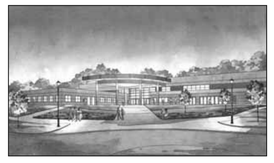
Rendering of Health, Wellness, and Lifelong Learning Center (approved for construction by University System of Georgia Board of Regents). The Health, Wellness, and Lifelong Learning Center is a $29 million dollar construction project. This instructional center will also serve as the campus' main sporting arena. It will house the Department of Physical Education and Recreation, Department of Nursing, the Center for Caring, and Continuing Education. The center will be located across from the current campus baseball complex on top of what is currently Public Safety.