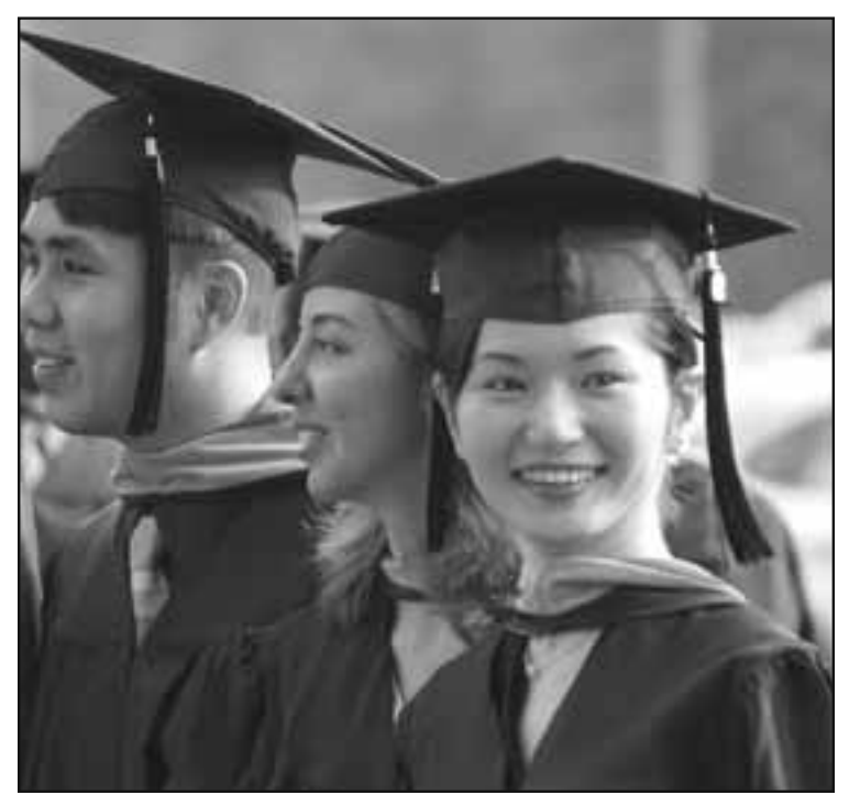
Graduate students enjoy their commencement ceremony.

A student who has completed one degree program must apply to the Graduate School for readmission to any second degree program. The approval of the department concerned and the Graduate School must be secured before the student undertakes a second graduate degree.