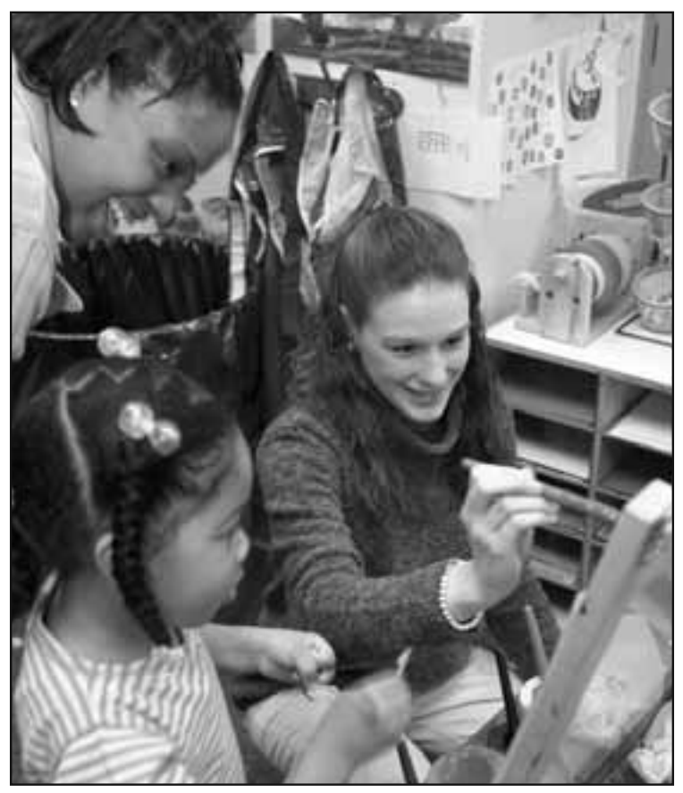
Many of Georgia's finest teachers, principals, counselors, media and technology specialists, speech-language pathologists, and superintendents claim UWG as their alma mater. The University is one of the nation's largest producers of beginning and graduate level educators.

These commitments culminate in educational experiences that foster the development of leaders and productive citizens who make positive impacts throughout an increasingly global society.