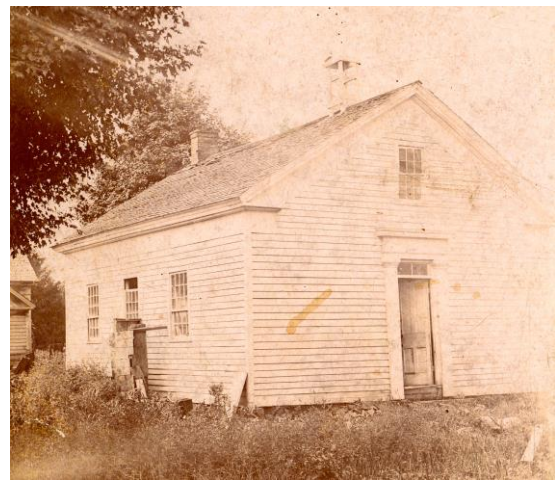
A larger school was built next door in 1840 for $200 plus painting. It served until 1887.