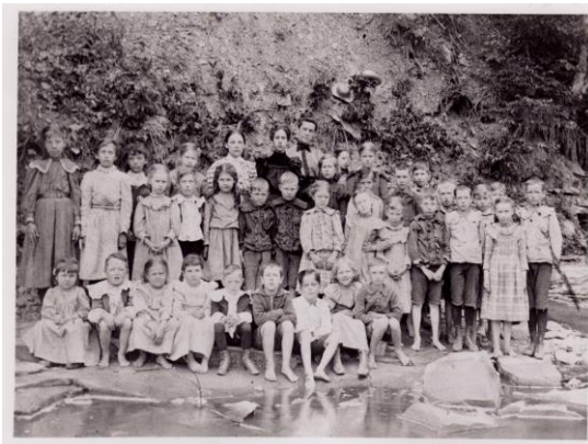
Weymouth school students at the Rocky River in 1898.