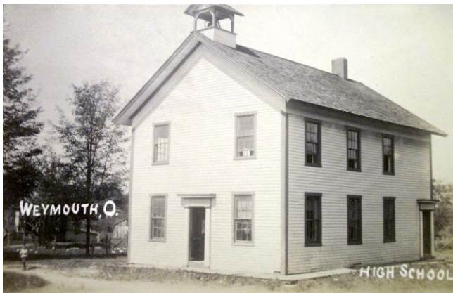
Weymouth School about 1896. Grade 1-4 were on the lower floor and “high school” grades 5-8 on the upper. This was Weymouth School from 1860 to 1925. It still stands on the NW corner of Old Weymouth and Frantz.