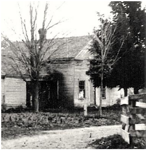
The Weymouth School built in 1829. It became a residence in 1872.