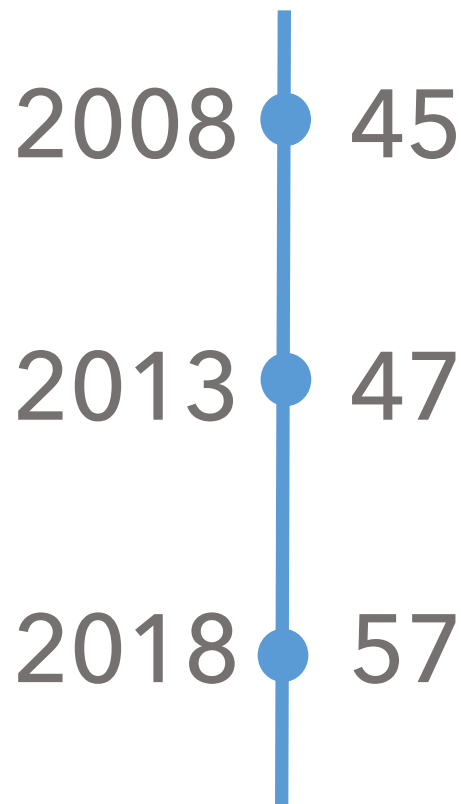
Women Ambassadors from the US over Time