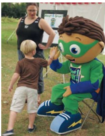
Above: The Ice Miller Indy Wine Fest , hosted by WFYI and presented by Clark Appliance, featured wines from across Indiana and around the world. Left: Super WHY greets a fan at the Penrod Arts Fair.

..... “WFYI IS THE COMPLETE PACKAGE. IT IS QUALITY ACROSS THE BOARD: RADIO, TV, COMMUNITY, EVENTS, ETC. THERE IS NO ONE REASON TO SUPPORT, RATHER SO MANY REASONS THAT MAKE IT DIFFICULT NOT TO SUPPORT.”