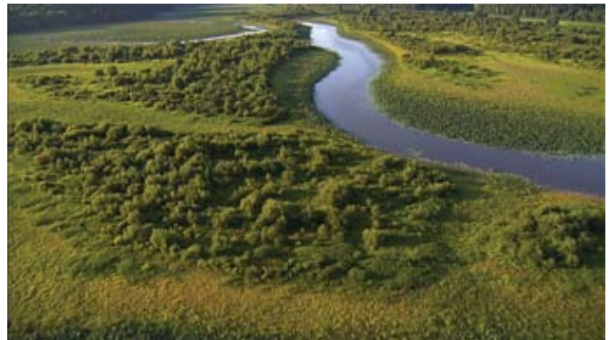
The Natural Heritage of Indiana earned Emmy Awards in the Best Science Program and Best Photography categories.

Overall Membership and an Overall Development Award