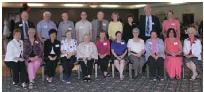
From top: WFYI volunteers lend a hand with Back Pack Attack; WFYI's 100 Hour Volunteers.