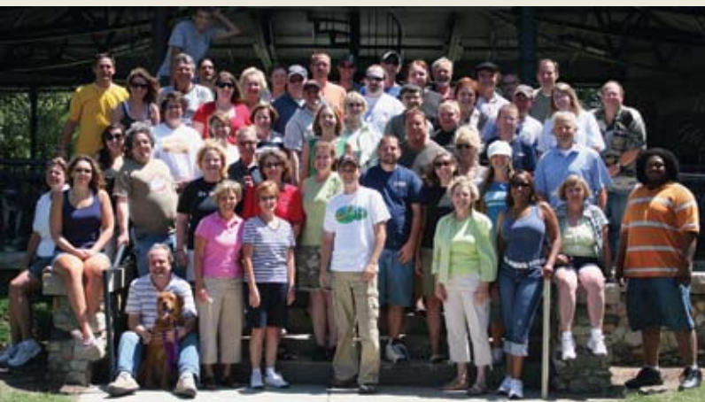
The WFYI staff.

Copyright © 2008 Metropolitan Indianapolis Public Broadcasting, Inc. All rights reserved.