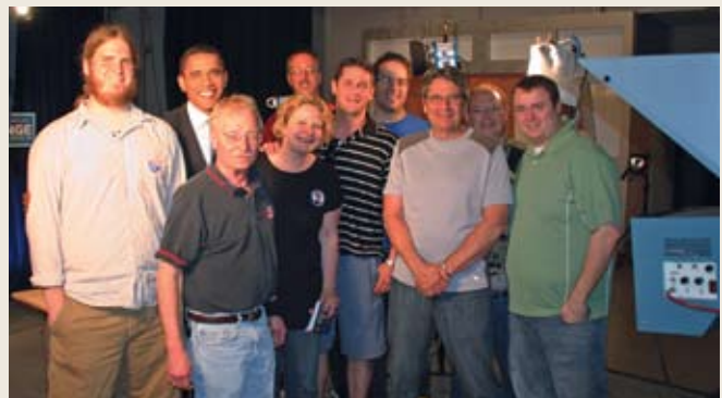
WFYI production staff with then candidate Barack O'Bara at the WFYI television studios six months before he would become President.