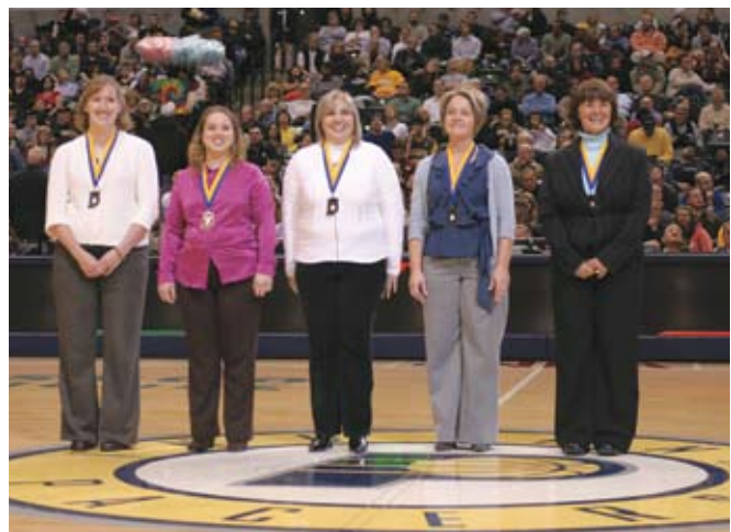
From top: The Truth About Cancer ; Childcare Providers of the Year honored as Hoosier Heroes by the Indiana Pacers.

..... "THE ENTIRE COMMUNITY WOULD BE A POORER PLACE WITHOUT WHAT YOU DO. YOU ARE APPRECIATED FOR WHAT YOU DO AND THE VALUE YOU BRING TO EVERYDAY LIFE IN INDIANA."