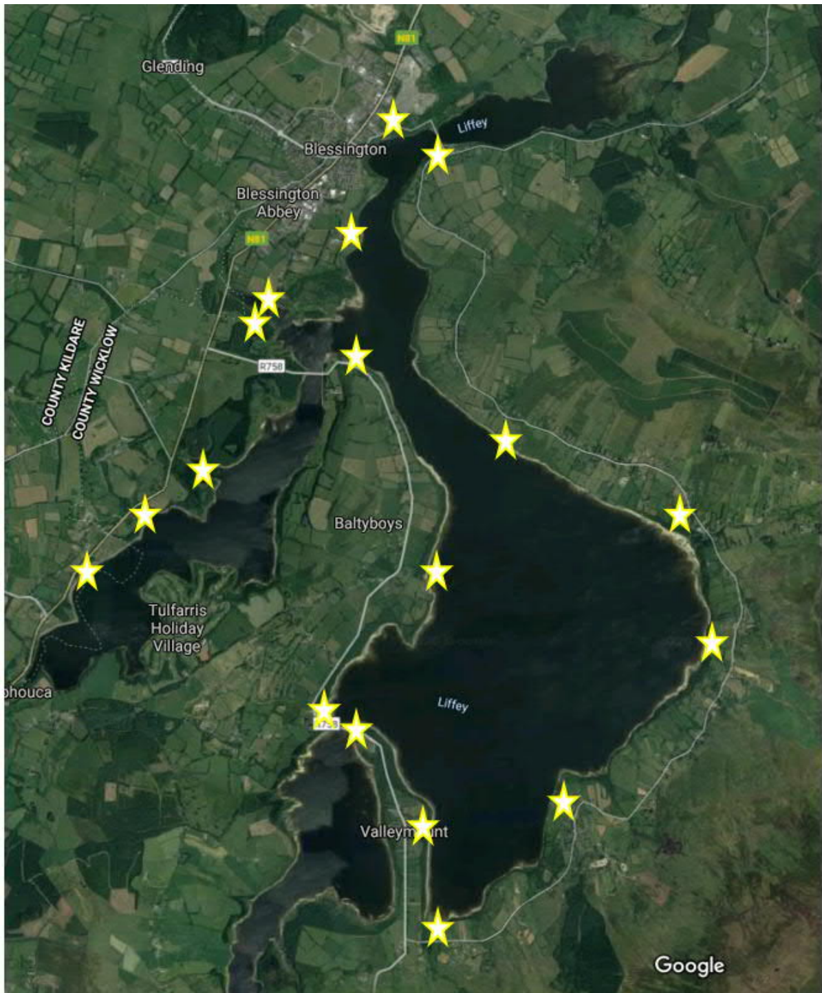
Figure 4-1 Construction Access Points