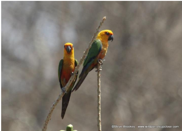
Overnight at Tamandare

Our hotel is very close to the coconut plantation where Jandaya Conures overnight so we will be there to watch them come in on an evening and fly out in a morning.