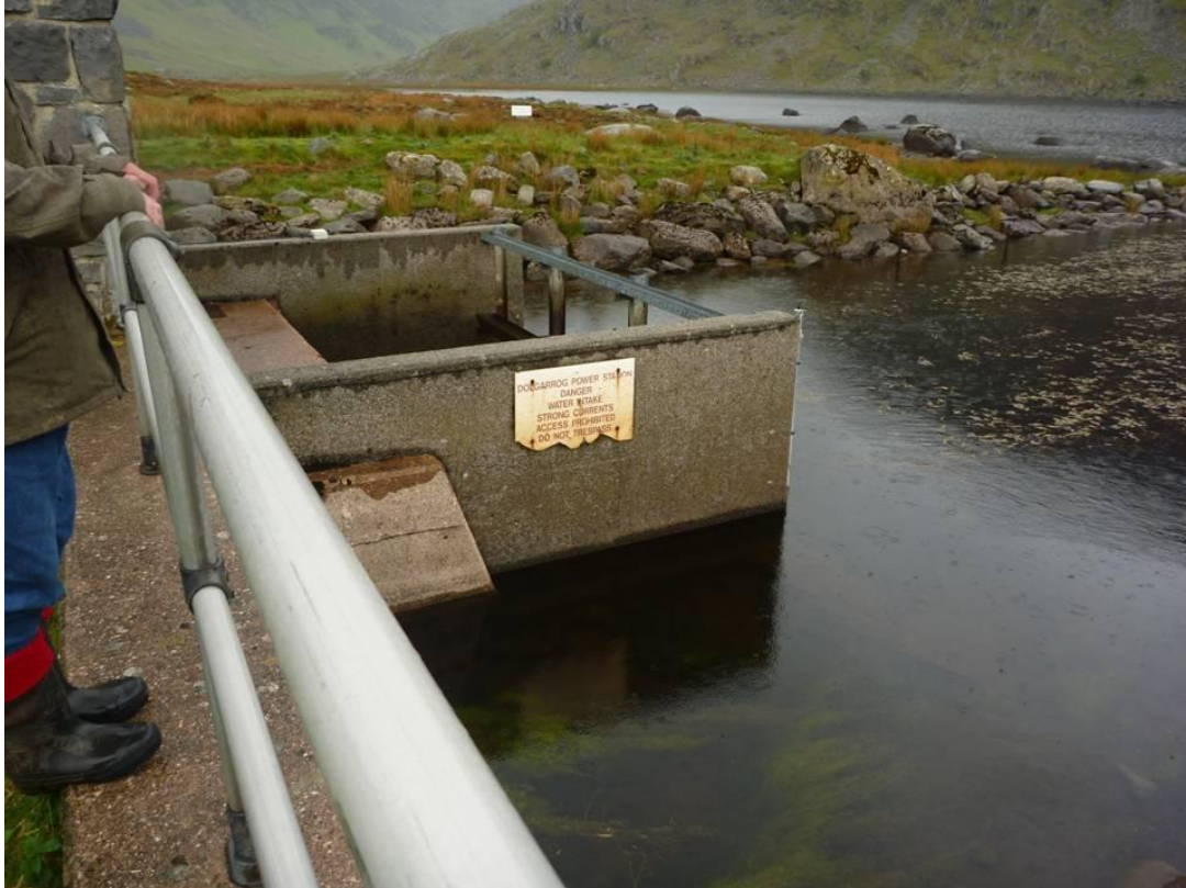
Figure 2: Draw-off point for transferring water and associated hydro-electricity generation

The first feature inspected was the draw-off outlet for hydro-electric generation at SH 72108 64900 (Fig. 2). Since the failure (and subsequent additional dismantling) of the dam, these sluice gates now exert the principle control on the level of water in the lake. Whilst the original damming would have artificially raised water levels, it is locally-believed that the current operation of the sluices impacts on the ecology of the lake. The protocol for the transfer of water imposes a heavily-regulated pattern of water level and, consequently, littoral (shore-line) wetting and drying regime.