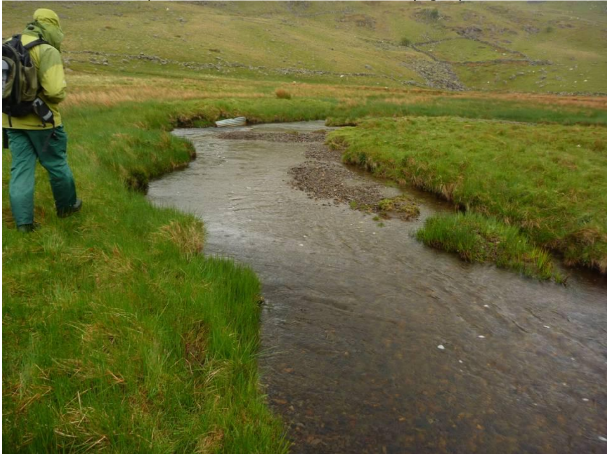
Figure 6: The lack of deep root structure (prevented from developing due to even comparatively light grazing at this elevation) is compounding an over-abundance of gravels by promoting low resistance in the riverbanks. Tussocks of grass in the channel (right of frame) and behind the corrugated iron revetment (upper left/middle of frame) indicate that the rate of bank erosion is too fast.

However, the bed material consists almost entirely of mobile gravels between approximately 20 mm and 50 mm in diameter. In addition, although the levels of grazing stock are relatively low, there is no succession of woody vegetation and there are examples of “block failure” of riverbanks (Fig. 6)