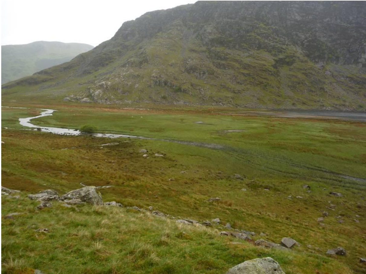
Figure 3: Afon Eigiau entering Llyn Eigiau via a diffuse network of vegetated channels

Members of the Dolgarrog angling club previously report captures of larger trout in the river system that are now no longer seen. Given the relatively small size of the river, this phenomenon could be consistent with a life-history similar to that exhibited by "dollaghan" trout in Ireland. In other words, fish growing to increased adult sizes within a lake habitat and re-entering the river system in order to spawn. Although the breeding and associated migration urge is incredibly powerful in brown trout, a reduced success rate in entering the feeder stream cannot be ruled out (either by reduced window of migration opportunity or increased predation impacts during delays).