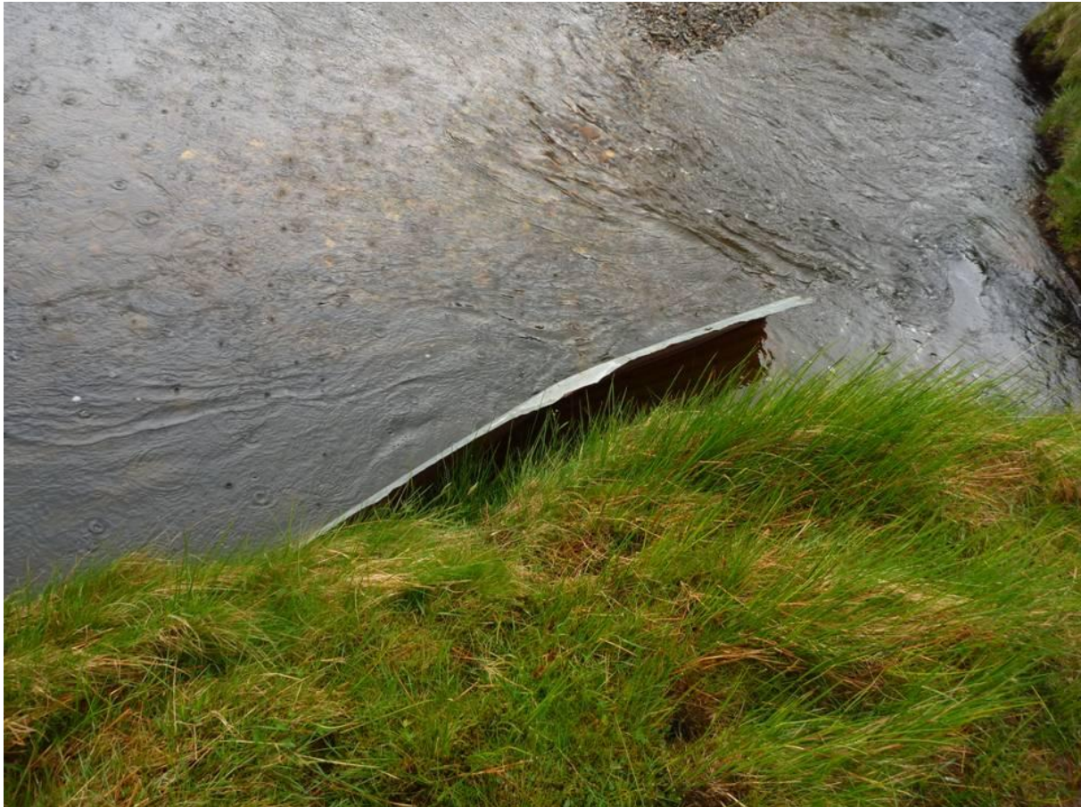
Figure 7: Sheet metal revetment (centre of frame) designed to protect the bank – but clearly causing worse erosion immediately next to it (right of frame)

The conditions in the sections of river detailed in this report are evident right up to the points at which the steep mountain-side streams join together in the valley-bottom to form the main Afon Eigiau. As a result, there is an excess of juvenile habitat and a lack of adult habitat – as well as an over-supply of gravel to the stream bed; increasing the bed mobility and the chances of egg/alevin wash-out.