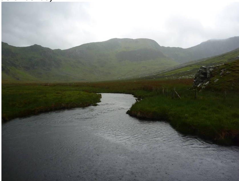
Figure 5: The river displays a meandering plan-form and there is quite a good degree of variation in depth, current velocity and cross-sectional profile evident. There is, though, little or no cover for fish.

Habitat within the river channel (Fig. 5) can be characterised as supporting features such as a meandering plan-form, riffles and lateral scour pools (deposition of gravels on the inside of bends and noticeable increases in depth on the outside of bends).