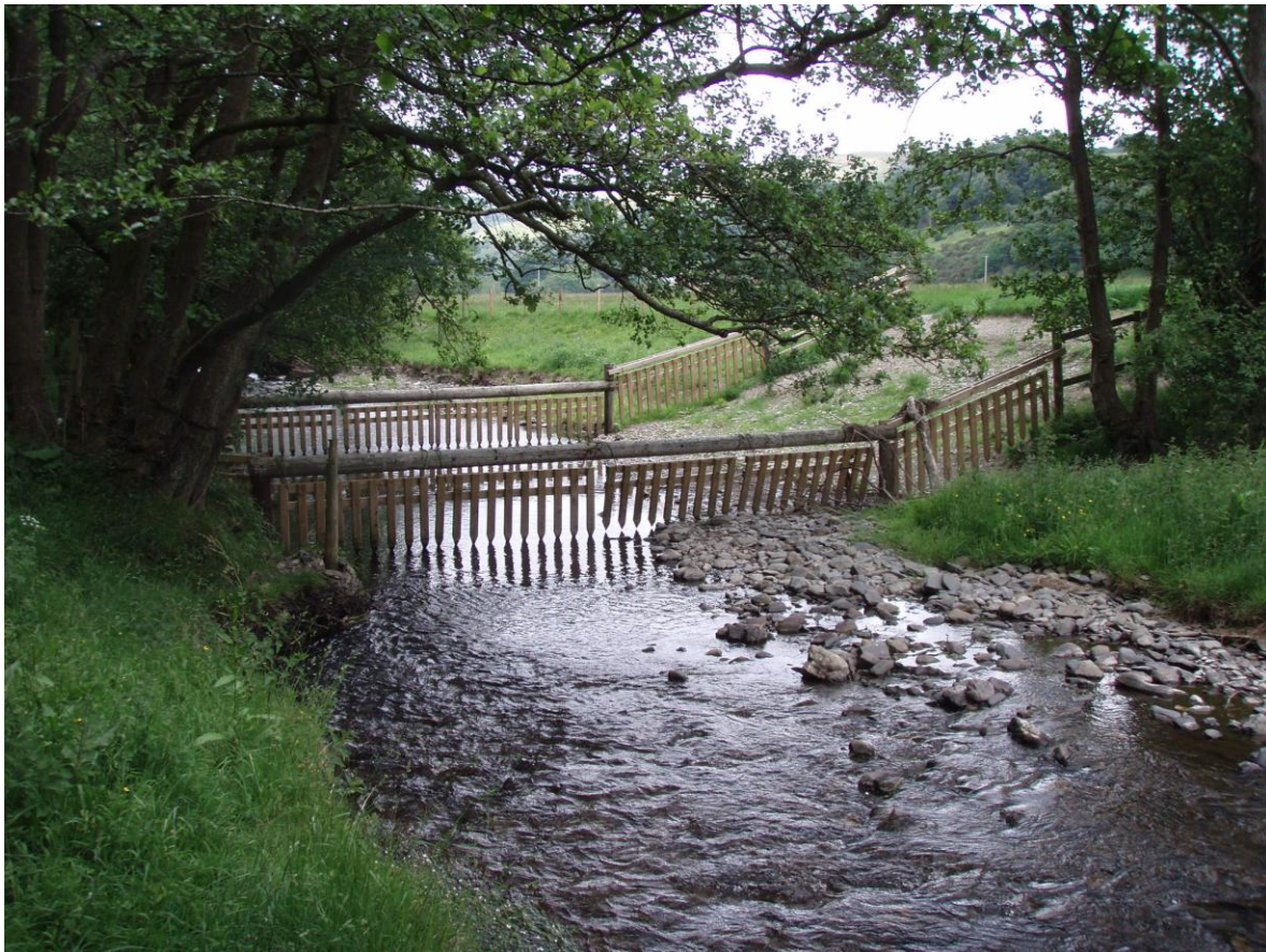
Figure 8: Example of top-hung water gates that would be required at each end of a grazing exclusion. Fencing panels that are orientated at 90-degrees to the river could also be installed in a similar fashion to prevent damage during out-of bank spate flows (or the use of loosely-tacked fencing panels that will break away during floods, and be easily replaced, can be a viable alternative)

It is a legal requirement that some works to the river may require written Natural Resources Wales consent prior to undertaking those works, either in-channel or within 8 metres of the bank. Any modifications to hard defences will require a land drainage consent on any river designated as “main river”. Advice can be obtained from the local Development Control Officer. The ownership of the land and its management for a means of electricity generation and farming will also