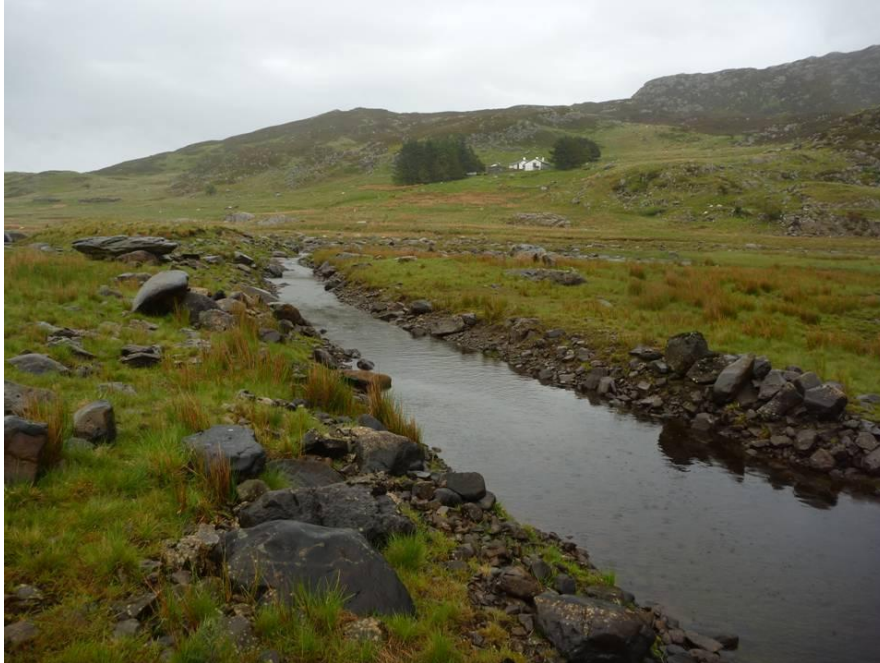
Figure 4: Recently-constructed bypass channel serving the hydropower system: a further complication for fish migration due to controlling influence on water levels and connectivity between the river and the lake. It is also very poor trout habitat.

easy to understand when nearly all of the “lost” area consists of productive shallows. By contrast, the remaining water consists of a more even split of both deeper refuge (also a vital habitat component) and a comparatively small area of shallow bays. On top of this, if there is even a small additional effect of either reduced spawning access or fish lost to the water-transfer system, the compounded effects could cause an effect that is greater than the sum of each individual part.