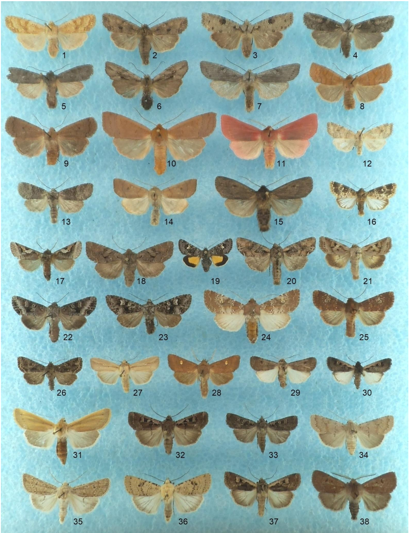
Plate 4 Natural Size 1:1