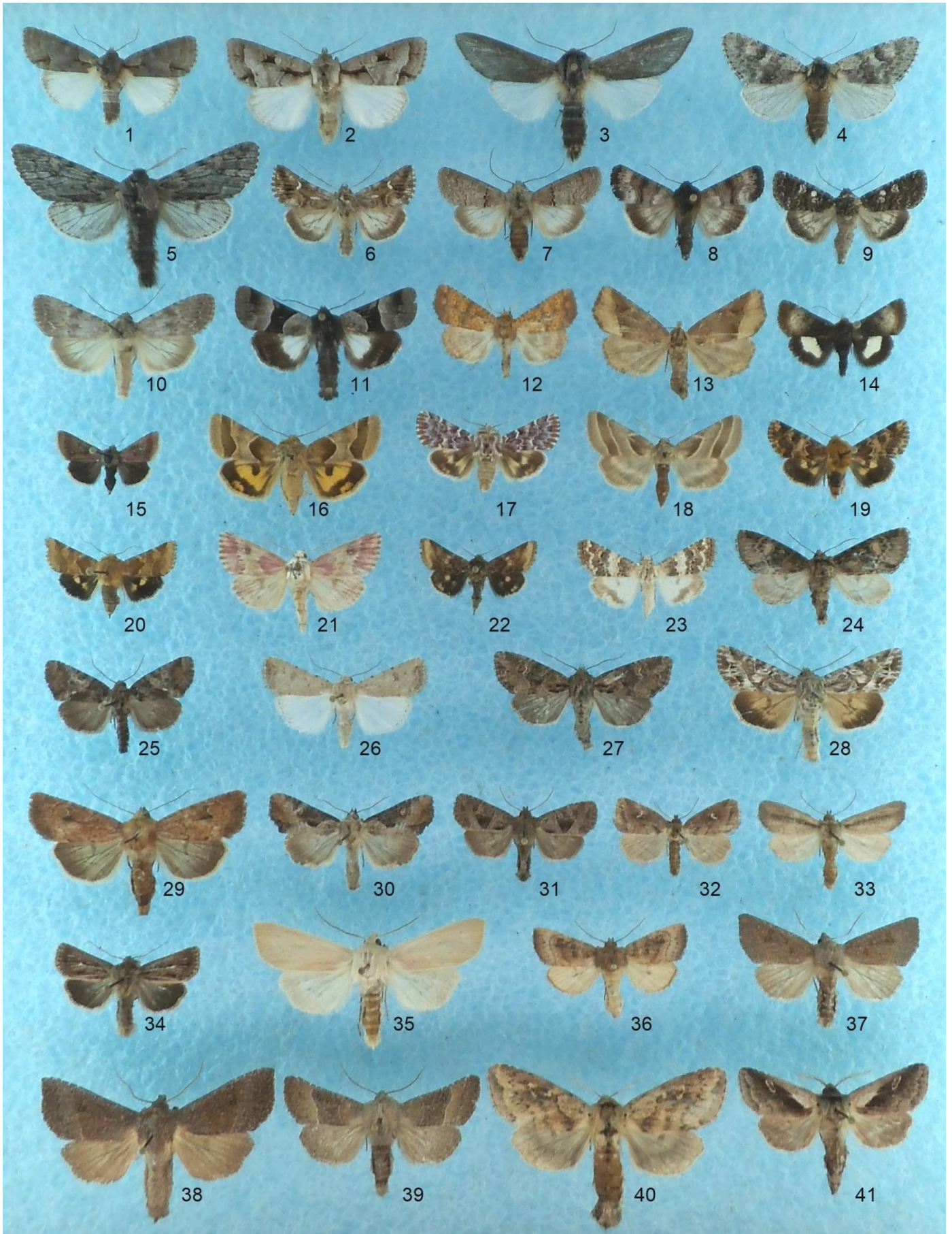
Plate 3 Natural Size 1:1