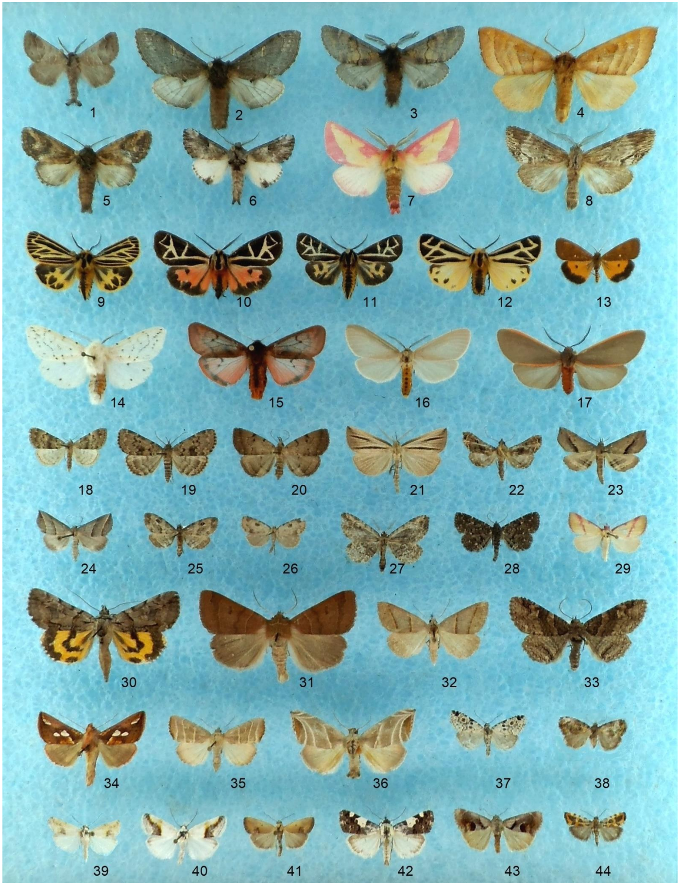
Plate 2 Natural Size 1:1