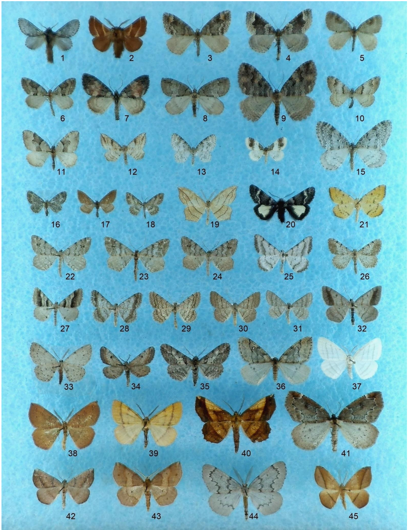
Plate 1 Natural Size 1:1