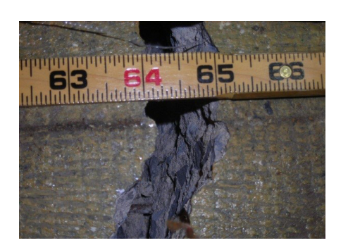
FIGURE 6. A ONE INCH-WIDE CRACK WITH A THREE-QUARTER-INCH VERTICAL OFFSET WAS DOCUMENTED IN A CONCRETE FLOOR SLAB OVER PYRITIC SHALE FILL. PORTIONS OF THE SLAB HAD HEAVED UPWARD MORE THAN TWO INCHES OVER THREE YEARS BEFORE THE SLAB AND UNDERLYING FILL WERE REMOVED.