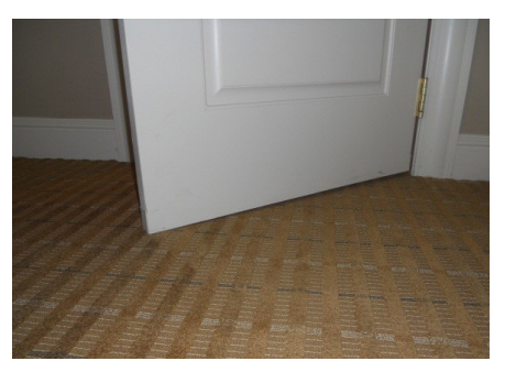
FIGURE 5. A HEAVED FLOOR SLAB HAS RESULTED IN A DOOR THAT CANNOT FULLY OPEN.

Symptoms of slab heaving (often mistaken for settlement) include sloping walking surfaces; cracks and offsets in slabs; cracked, buckled, and crushed drywall; binding doors; and separating or crushed millwork. Effectively managing the symptoms (e.g., grinding slabs, adjusting and under-cutting doors, repairing finishes) is almost always an iterative and disruptive process that ultimately accumulates significant effort and costs. Addressing the cause to prevent future heave requires a one-time project to demolish and reconstruct the slab-on-grade (which, by proximity, necessitates the removal and