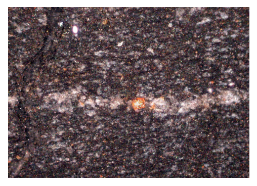
FIGURE 2. A RELATIVELY THICK BEDDING PLANE CONTAINED IN A SHALE FRAGMENT IS PICTURED. A BRASSY YELLOW PARTICLE COMPOSED OF IRON SULFIDE IS LOCATED WITH THE RELATIVELY THICK WHITE LAYER.