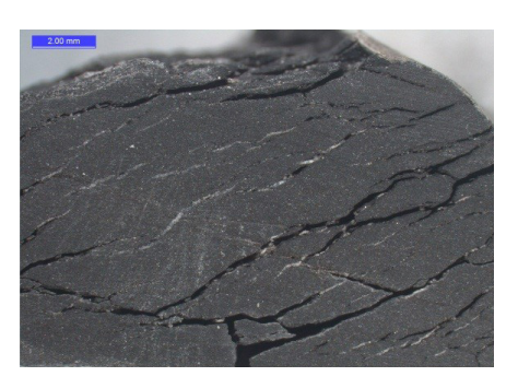
FIGURE 4. A SHALE PARTICLE HAS EXPANDED AT AND NEAR BEDDING PLANES. NOTE THE SECONDARY WHITE CRYSTAL (GYPSUM) GROWTH WITHIN THE EXPANDED BEDDING PLANES.

The sulfuric acid (H_2SO_4) by-product of pyritic degradation can react with the calcium carbonate (CaCO_3) component inherent to common fill material such as limestone to form gypsum (CaSO_4) . Since the products of gypsum formation occupy much larger volumes than the materials consumed, this process is expansive. As a result, fills containing significant amounts of framboidal pyrite, in combination with calcium carbonate, can cause substantial movements of supported or embedded