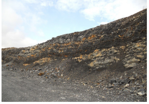
FIGURE 1. A PYRITIC SHALE FORMATION IS EXPOSED AT A QUARRY FACE. WITHIN THREE YEARS OF EXPOSURE, OXIDATION OF THE PYRITE HAS LED TO IRON OXIDE STAINING AND DEGRADATION OF THE SURROUNDING SHALE.

Many forms of pyrite are stable. However, framboidal pyrite readily degrades when exposed to air and moisture. Black shales with inherently weak bedding planes typically offer little protection of embedded framboidal pyrite particles. Potential for exposure is increased if the pyrite-containing material is broken up (e.g., by crushing to produce aggregate, or by excavation, placement and compaction when used as fill). Placing material in a new environment can also increase exposure potential. Exposed pyrite reacts with the air and moisture in an