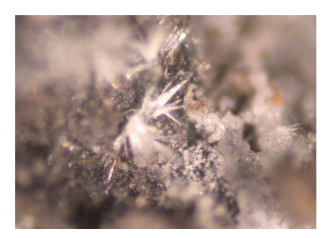
FIGURE 3. A MICROGRAPH OF GYPSUM CRYSTAL GROWTH WITHIN AN OPEN BEDDING PLANE IN THE SHALE PARTICLE.