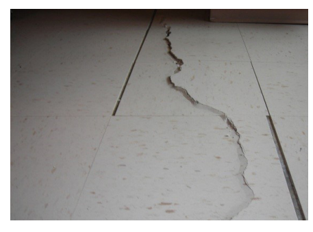
FIGURE 7. A FLOOR SLAB OVER PYRITIC SHALE FILL AND DOWELED INTO A PERIMETER GRADE BEAM EXHIBITED A LARGE CRACK WITH VERTICAL OFFSET AND ROTATION ABOUT THE DOWEL POINT INTO THE GRADE BEAM.

FIGURE 6. A ONE INCH-WIDE CRACK WITH A THREE-QUARTER-INCH VERTICAL OFFSET WAS DOCUMENTED IN A CONCRETE FLOOR SLAB OVER PYRITIC SHALE FILL. PORTIONS OF THE SLAB HAD HEAVED UPWARD MORE THAN TWO INCHES OVER THREE YEARS BEFORE THE SLAB AND UNDERLYING FILL WERE REMOVED.