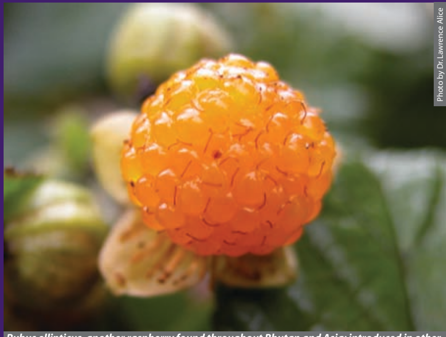
Rubus ellipticus, another raspberry found throughout Bhutan and Asia; introduced in other countries for fruit production.

been introduced as groundcover or as flowers in a yard. "A lot of times it becomes too late before we see it as a problem," he said. "The more knowledgeable I can become on a global basis on these species of Rubus the more types of projects I can get involved in." He is hoping his research