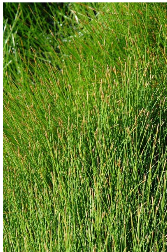
Dense stand of E. elongata – stems slender and spikes about as wide as supporting stems