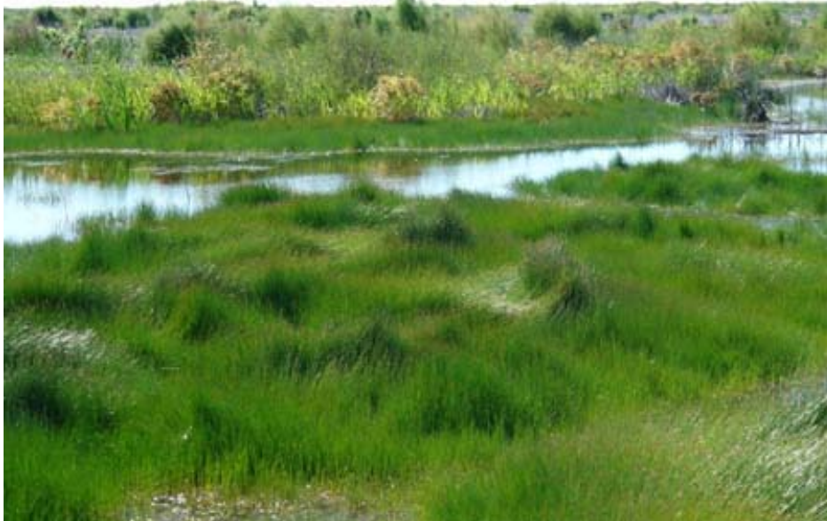
Left: Dense stand of Eleocharis elongata at Lacassine Pool, Cameron Parish.

Right: Submersed form of E. elongata referred to locally as “angel hair”. Stems flaccid and sterile. Aerial stems are present in the top part of the image.