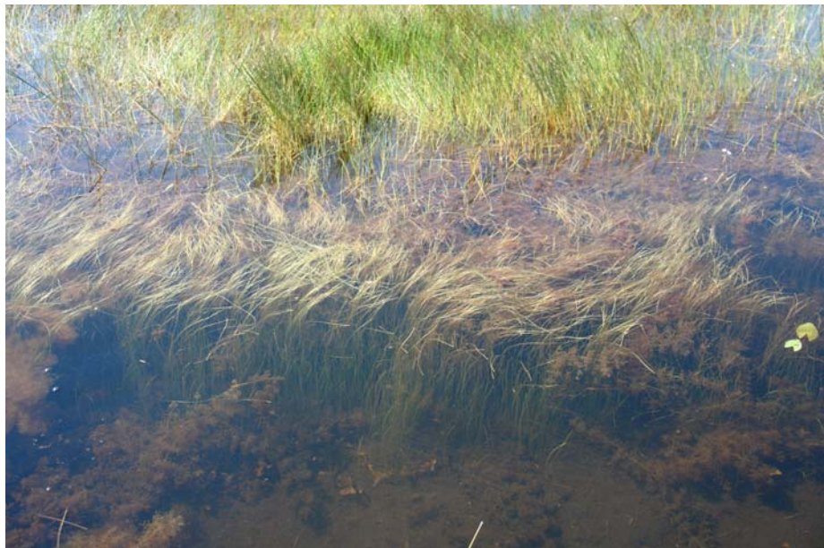
Photo taken in a marsh pond in Lacassine Pool, Cameron Parish.

Right: Submersed form of E. elongata referred to locally as “angel hair”. Stems flaccid and sterile. Aerial stems are present in the top part of the image.