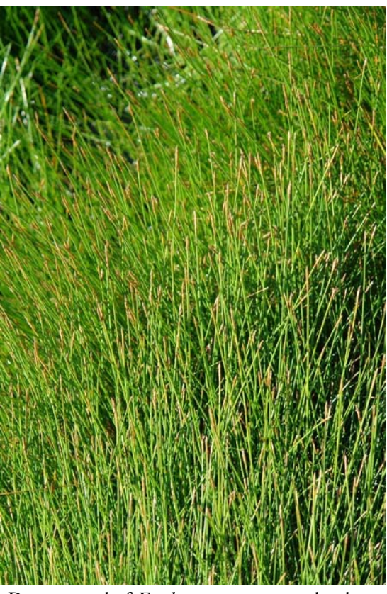
Dense stand of E. elongata – stems slender and spikes about as wide as supporting stems