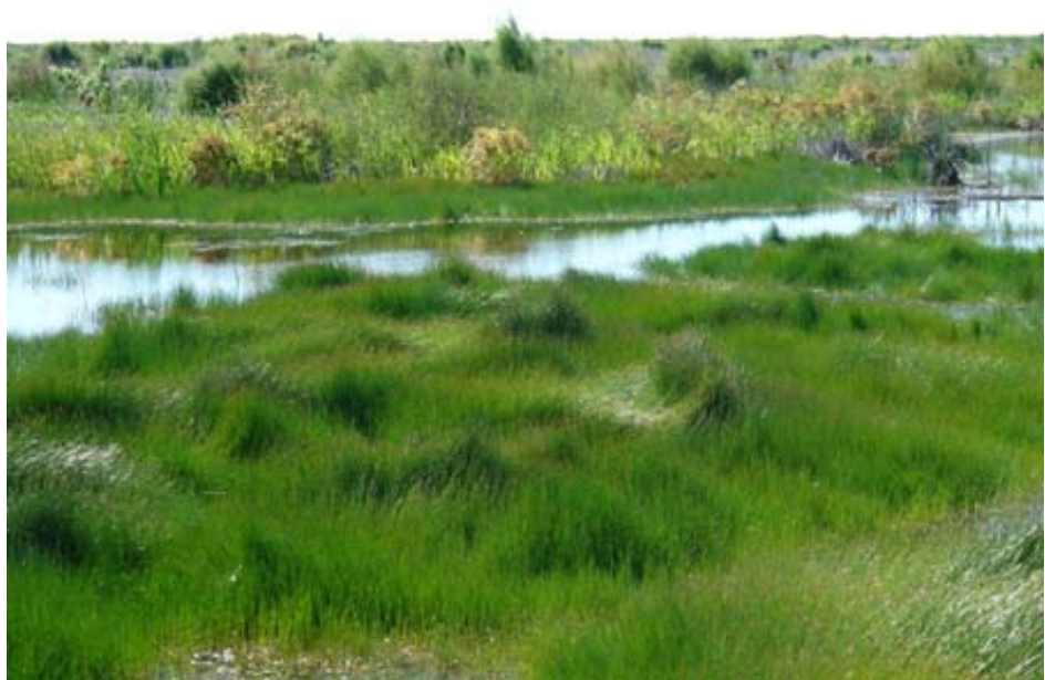
Left: Dense stand of Eleocharis elongata at Lacassine Pool, Cameron Parish.

Right: Submersed form of E. elongata referred to locally as "angel hair". Stems flaccid and sterile. Aerial stems are present in the top part of the image.