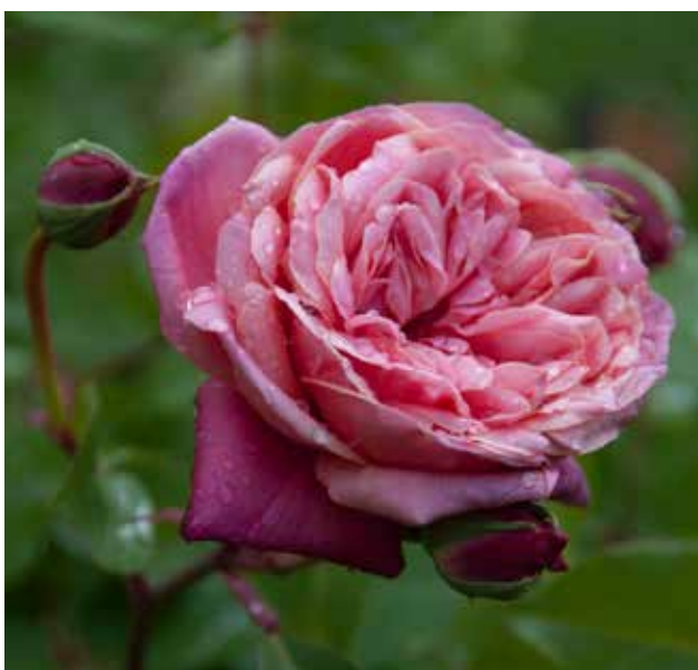
'Archiduc Joseph' © P. Cavallo

The following pictures are shown in alphabetic order