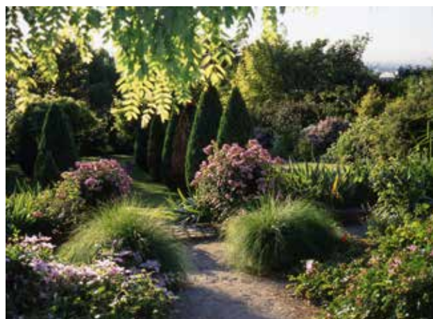
One of the many paths in the garden, this one bordered with 'Raubritter' and Pennisetum