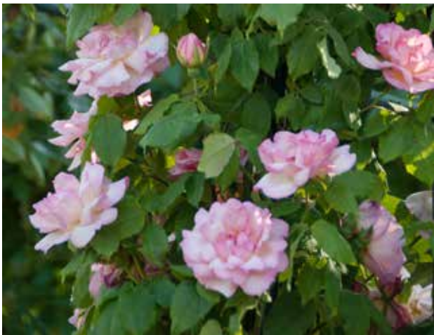
'Lady Waterlow'