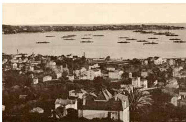
View of Golfe-Juan