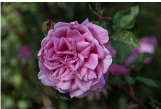
'Marie d'Orleans'