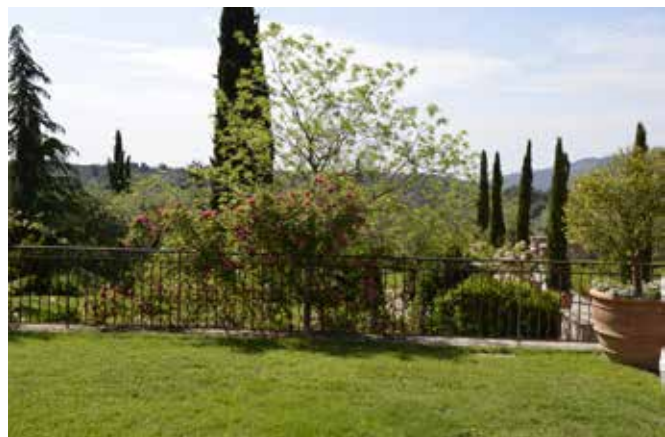
Domaine Saint-Jacques du Couloubrier

Through their work, these three rose horticulturists contributed so greatly to the development of varietal types particularly suited to Mediterranean climatic conditions that contemporary landscapers ought to rely on more, both for urban areas and in private gardens. The city of Hyères on the coast has done so along one of the main avenues planted with Nabonnand rose varieties which provide a constant field of color throughout the season. In Grasse, the Domaine Saint-Jacques du Couloubrier , owned by the Amics in the 1870s, has regained its magnificence after 15 years of restoration. This 8-hectare estate dotted with olive trees and Mediterranean species, hosts superb landscape creations: a garden created by Russell Page in the 1940s, a perfume garden, a melliferous meadow, a monumental rockery, a Provençal garden, a rose garden in honor of hybridizers, but also a unique