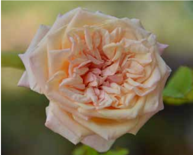
'(Mlle) Franziska Krüger'