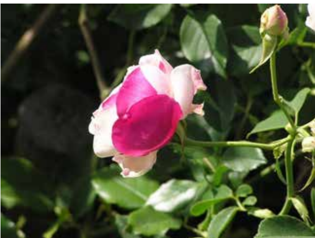
'Fortune's Five-colored Rose'

Fortune writes of another "fine new double yellow rose" which he saw in Soo-Chow (Xuzhou) northwest of Shanghai. He procured it and sent it to the Horticultural Society as well. His description echoes his first reference to 'Fortune's Double Yellow' but omits the word climbing. Presumably, this rose did not climb, but it was a yellow rose. There seems, however, to be no later record of it.