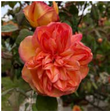
'Souvenir de Gilbert Nabonnand'