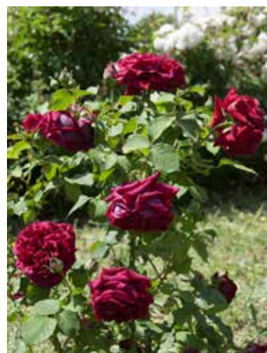
'Frau O. Plegg' © P. Cavallo