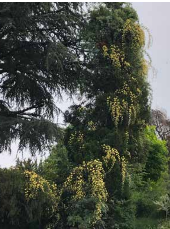
Rosa banksiae plena climbing through trees

Shrubs: Viburnum , Peonies , Hydrangea , Choysia , Cotinus , Sambucus , Physocarpus and Phlomis endure and still perform their role. It must be admitted, however, that clematis are disappearing and that undivided bulbs are suffocating, irises are stifled and day-lilies crushed against one another.