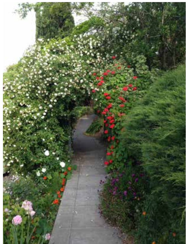
‘Fortuneana’ in front of the author’s home

The most historically fascinating of Fortune’s five named roses is the incredible ‘Fortuneana’. One of the healthiest of hybrid roses, and rather similar to a Banksiae rose, it produces very long, slender and pliable canes with double flowers decorated all along the sleeves of each branch. Cream-colored roses, they exhale a wisp of violet fragrance. Three lanceolate leaflets to a leaf, the foliage is light green and shiny. Easily, even in poor soil, this huge plant can parade more than a thousand roses. It requires very little care, yet will grow spectacularly over a pergola or arch.