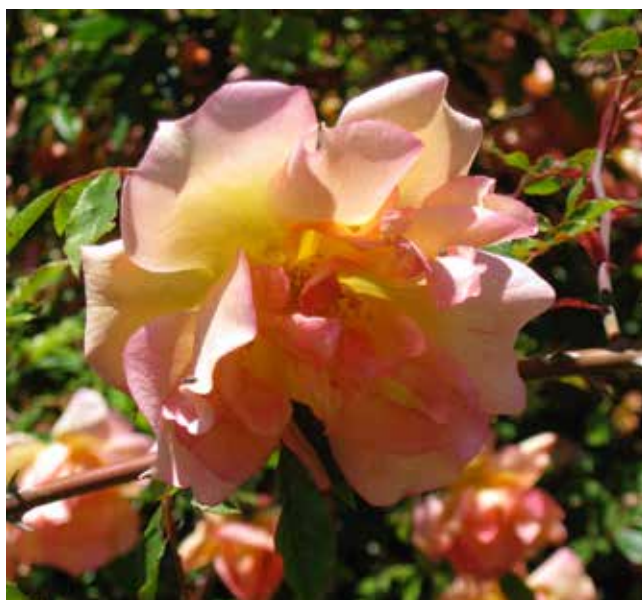
'Fortune's Double Yellow' © D. Schramm

The following year, 1845, Robert Fortune sent 43 Wardian cases of plants and seeds to the Royal Horticultural Society. Roses he sent were well-watered before being placed in Wardian glass cases, then their damp soil, eight to ten inches deep, was covered with moss and the cases sealed. These containers, according to the Society's journal of May 1, 1846, included "Several Roses, among which is a fine new double yellow climbing kind." He had first seen it in 1844 on entering the Ningpo garden of a high public official of Imperial China, a Mandarin, where it "completely covered a distant part of the wall" as "a mass of yellow flowers" but "not a common yellow . . . masses of glowing yellowish and salmon colored flowers" which the Chinese called 'Wang-jang-ve'. The blossoms varied in their coloration. In 1850 during his second trip to China, he reports seeing this rose again growing with other roses in nursery pots. Though he first viewed the rose in Ningpo and then eighty miles north across a bay in Shanghai, he learned it was a rose from the more northern regions of China. The rose today is called 'Fortune's Double Yellow'.