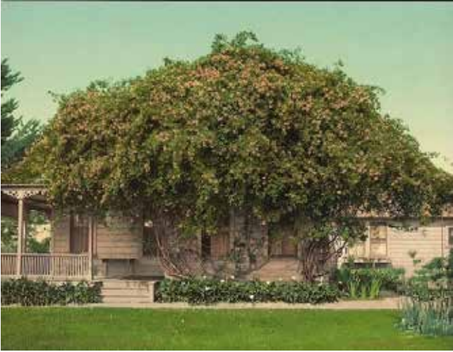
Photograph of 'Fortune's Double Yellow' Pasadena, California ~ 1902

Sometimes also called 'Gold of Ophir' (a reference to the land from which King Solomon's ships brought gold), this incredible rose can cover a garage or large shed in a spectacular mantle or blanket of gold. The variable and fragrant blooms are semi-double but sometimes full on short stems, but the canes are long and flexible and can be trained. As the long-lasting flowers age, the outer petals reflex, creating a loosely open blossom. A plant for warm climates, it continues to bloom intermittently after spring. In its early years in England, it was, writes Graham Thomas, "the most brilliant rose of its time." One such plant grows near me in California on a grassy lot where it covers a thirty-foot tree, lavish with thousands of roses each year that never get pruned.