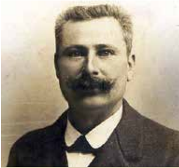
Clément Nabonnand © Family archives

gigantea which might have resulted in re-blooming varieties in this class.