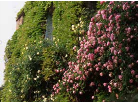
'Mme Grégoire Stachelin' covering the house

My garden made up of collections brought together with joy, patience and passion over more than forty five years will, within a few months, evolve and become simpler before it turns into a “Green Area,” then becoming wild and, in all likelihood, disappear. Never having been in the hands of a landscape designer or a professional gardener, the garden has adjusted itself to errors and creative whims.