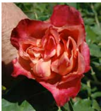
'Général Gallieni' © D. Massad

The participation of Nabonnand father and sons in exhibitions now extended beyond the regional area. In 1898, the newspaper Le Courier de Cannes informed its readers of the successes they had achieved in Paris: "The skillful rose horticulturalists of Golfe-Juan obtained the highest award at the Paris Horticultural Exhibition, a gold medal for a collection of wonderful roses, comprising of 800 varieties."