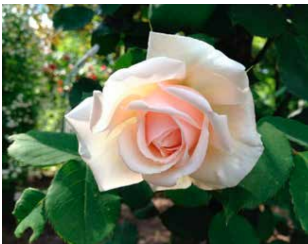
'Comtesse de Noghera'