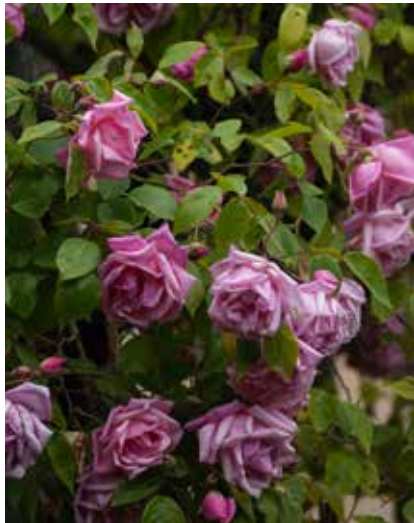
'Wasily Chludoff'

both pale pink Teas; '(Mlle) Franziska Krüger' (1879), a cream quartered flower Tea tinged with pink; 'Reine Olga de Wurtemberg' (1881), a fragrant crimson-red Noisette hybrid; 'Nardy' (1888), a Tea-Noisette with globular, yellow blooms that turn pink depending on the temperature; 'Papa Gontier' (1882), 'Madame la Princesse de Radziwill' (1886), 'Bardou Job' (1887), and 'G. Nabonnand' (1888), all Tea roses; 'Wasily Chludoff' (1896), a medium-pink climbing Noisette perfectly suited to grow over pergolas, 'Général Gallieni' (1899), a Tea with blooms of an unusual mix of yellow, pink and carmine; 'Noella Nabonnand' (1900), a Tea with a powerful scent of rose emanating from a crimson corolla and 'Lady Waterlow' (1902), a strong growing hybrid Tea with very refined yellow flowers tinged with pink.