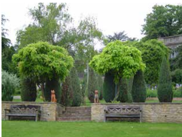
Two statues of lynxes, flanked by wisteria guided visitors back towards the house

I try to remain serene and think positively about the young people I trained and who helped me in the garden over so many years. Several of them went on to set up their own businesses. Over and over again I repeat to myself this sentence of Laure Parisot: "Life is an ongoing exchange. We receive and learn to give. And to give is also to pass on, including passing on knowledge. Passing on knowledge is part of the fundamental exchange of life." I also think of all the encounters, the great friendships, of travel on account of the garden, and I say Thank You!