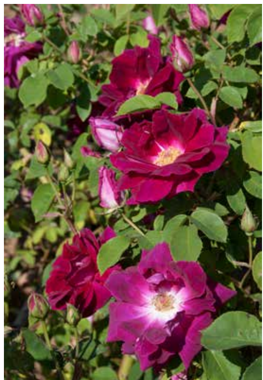
'Noella Nabonnand'