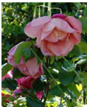
'Comtesse de Caserta' © P. Cavallo