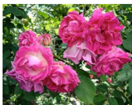
'Monsieur Rosier'