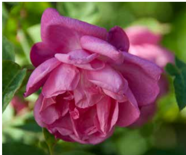
'Souvenir de Germain de Saint-Pierre'

8) To conclude this list, it is necessary to cite 'Comte d'Eprenesnil' , a hybrid of Rugosa, put on the market in 1881 by Gilbert, a relative rarity for the time.