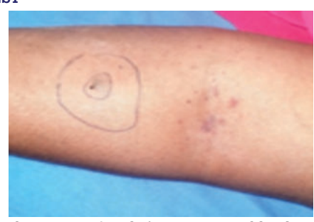
It is done by injecting 0.5ml of patient's own blood as a source of RBCs into her forearm.