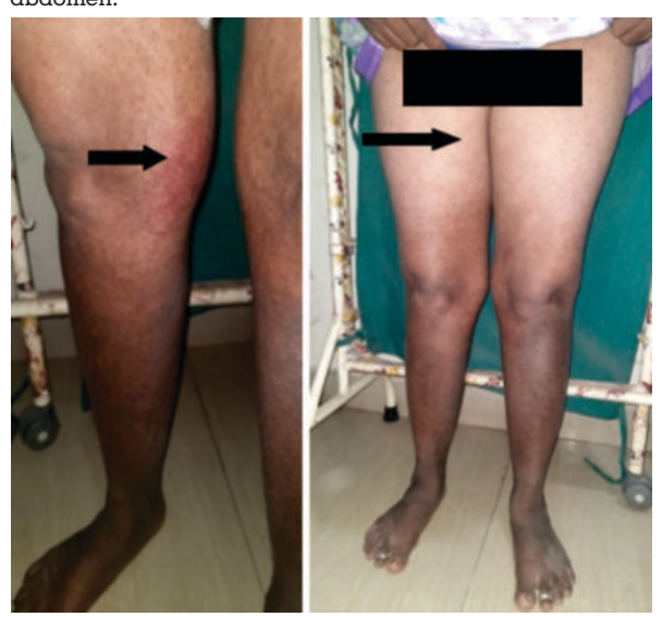
Fig 1&2: showing multiple petechiae in the medial side of thighs and legs.

The episodes were frequent and were heralded by pain and edema of legs, followed by petechiae progressing to ecchymosis within a day. Lesions occurred at intervals of 7 to 10 days. Not associated with itching, fever, joint pains or any other symptoms. She was excessively worried since her mother's demise and had low level of mood when visited. Multiple violaceous non edematous non blanchable tender ecchymotic patches over thighs , medial side of legs, and abdomen.