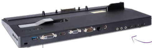
Optional docking station 850 for Mobile 1542K Item-Nr.: 1480996