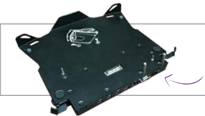
Optional docking station for 1431s Item-No.: 1481104