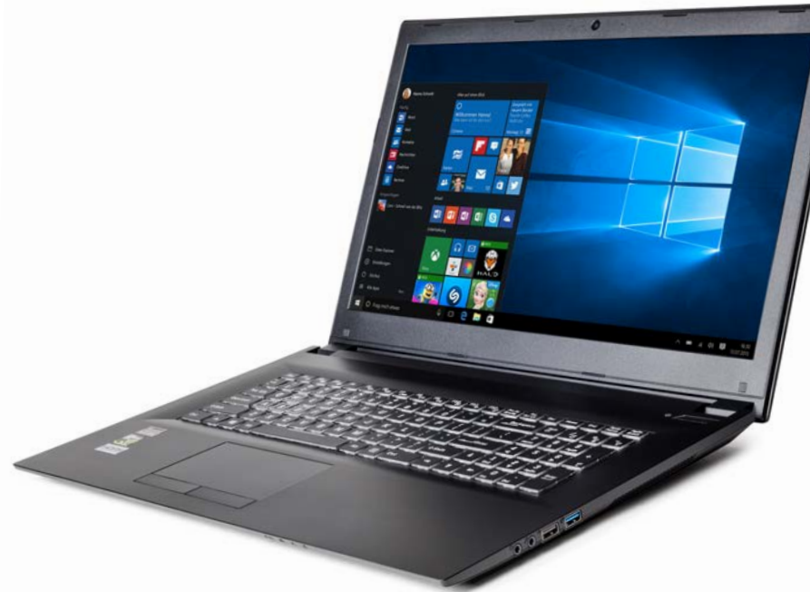
TERRA MOBILE 1776