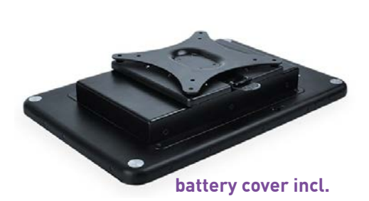
holder for mounting foot Item no.: 1481260 (PAD 885) Item no.: 1481257 (PAD 1085)