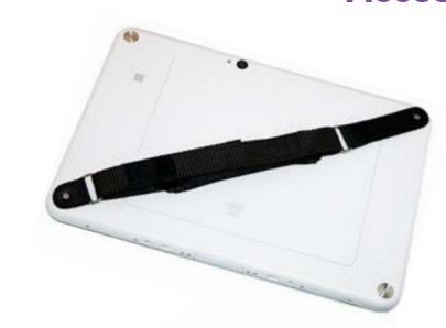
Carrying strap module Item no.: 1481134