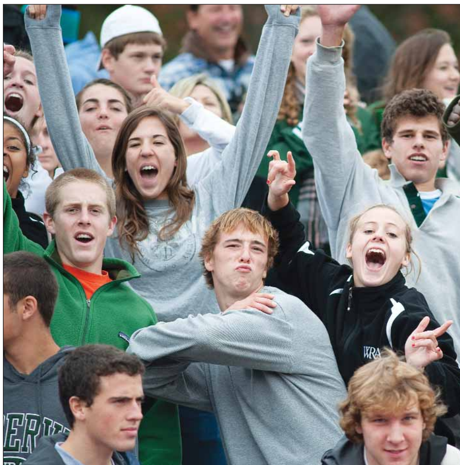
Students cheer on the Pioneer football team during a game against Lake Forest Academy at the Stadium.

Kaufman Foundation Inc. Kentucky Christian Foundation Krause Family Foundation Kritzer Family Foundation Laub Foundation Lincoln Financial Foundation The Lippy Foundation Lubrizol Foundation Macy's Foundation McCormick Foundation Merck & Company Merrill Foundation Merrill Lynch & Company Foundation Michel Family Foundation Microsoft MMC Matching Gifts Margaret Clark Morgan Foundation The Burton D. Morgan Foundation Mudd Construction New York Life Foundation New York Life Insurance Nicholson Family Foundation Nokia Nordson Corporation Northwestern Mutual Life Norweb Foundation Owens-Illinois Inc. PepsiCo Foundation Pfizer Foundation PNC Bank, N.A. Progressive Insurance Foundation Prudential Foundation Quest Diagnostics Matching Gifts Program Raytheon Company Refrigeration Sales Corp. San Diego Foundation Sangree Family Foundation Schwab Fund for Charitable Giving Sherwin-Williams Foundation Springcreek Advisors Springfield Foundation Target The Pimco Foundation Carol Colman Timmis Foundation Toledo Community Foundation Towers Perrin Forster Crosby UBS Foundation USA UBS Matching Gift Organization Underwood Painting, Inc Wachovia Foundation Wells Fargo Foundation Whittemore Foundation