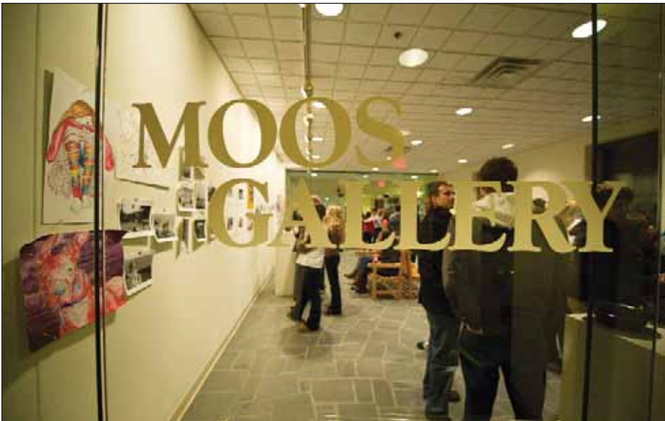
The Moos Gallery, located in the Knight Fine Arts Center, is home to four student arts shows each year, as well as shows and receptions from nationally known artists.