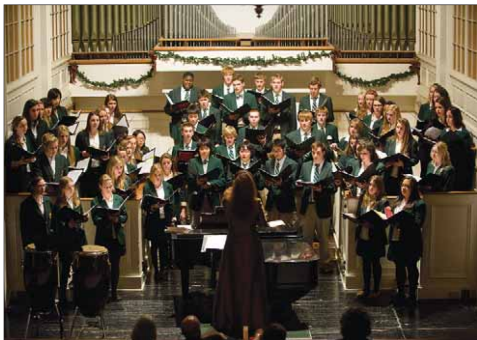
The Academy Choir performs at the annual Vespers program in the Chapel.