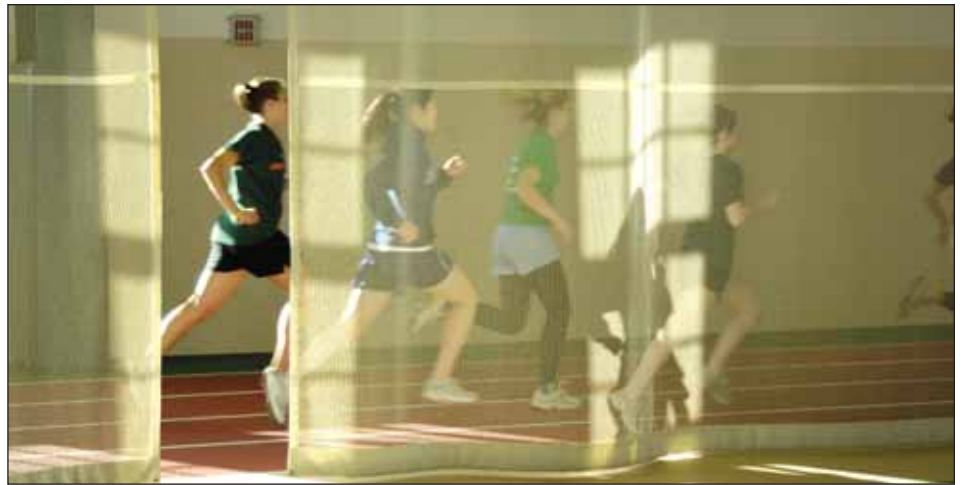
The late afternoon sun illuminates members of the girls track team as they practice on the running track in the Murdough Athletic Center's fieldhouse.