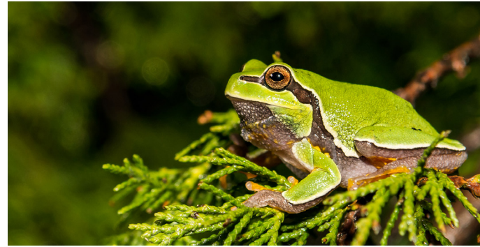
Pine Barrens treefrog