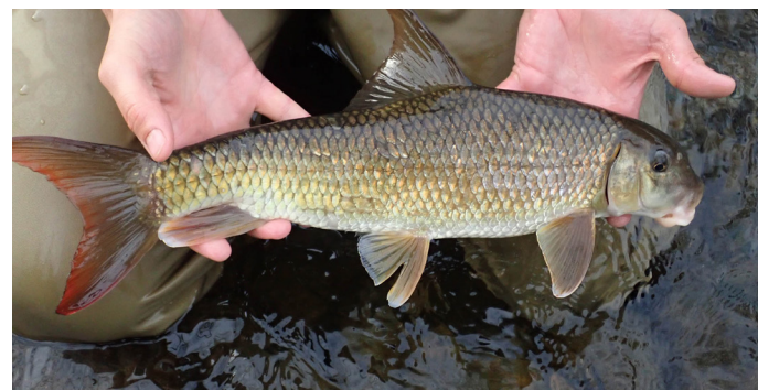
Sicklefin redhorse