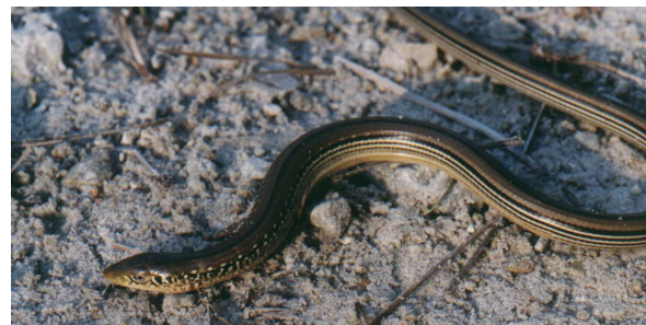
Mimic glass lizard (Jeff Hall)