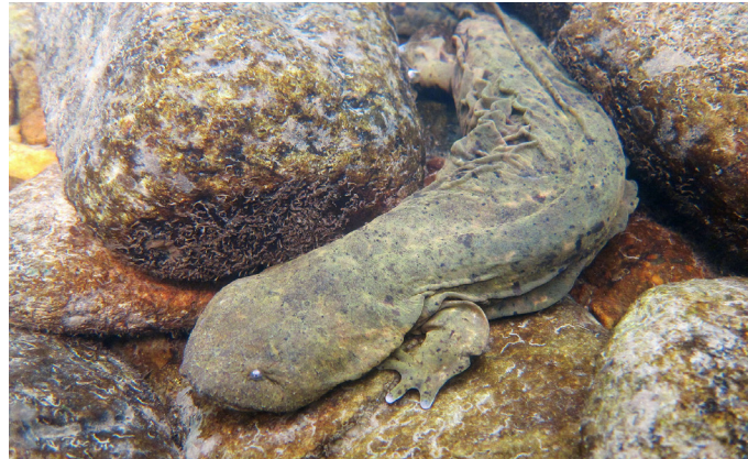
Eastern hellbender