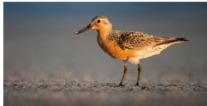
Red knot