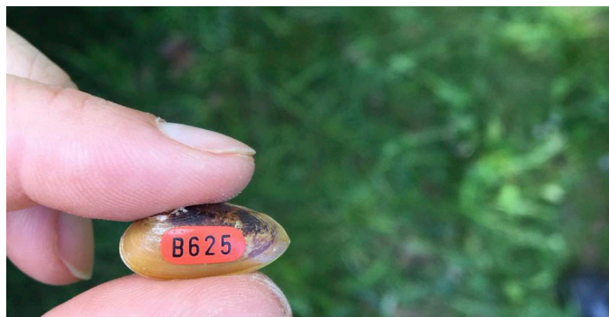
Yellow lance (NCWRC)