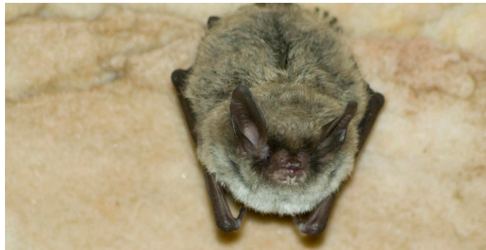
Northern long-eared bat