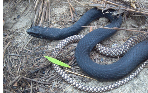
Eastern coachwhip (Jeff Hall)