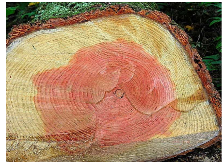
Fresh heartwood is red colored