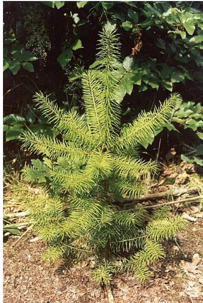
sapling in a large gap