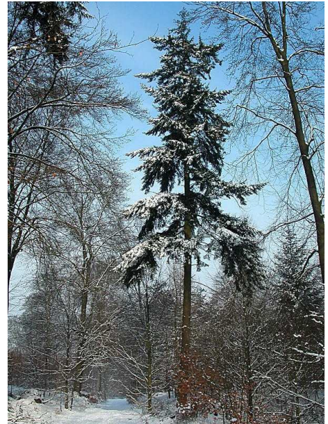
Mature tree in Middachten Estate