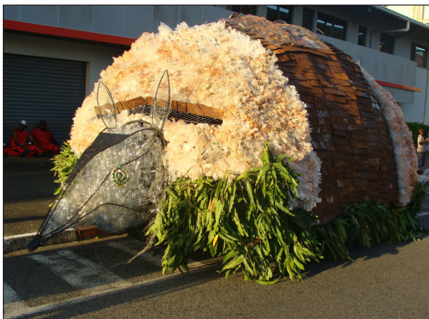
FIGURE 5. A representation of an armadillo at the main Carnival parade in Cayenne, February 2010.

were caught alone with no other conspecific in the immediate vicinity;