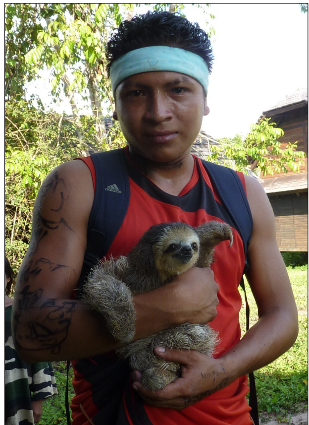
FIGURE 4. A young Bradypus tridactylus kept as a tamed pet by a Wayāpi Amerindian at Trois-Sauts. Photograph by François Catzefflis (November 2010).

Sloths, in their turn, benefit from a very positive value assigned to them in Wayāpi culture. If Bradypus tridactylus is the commonest game sloth in numbers, the two-toed sloths are even more appreciated. Both taxa are regularly kept as pets (FIG. 4),