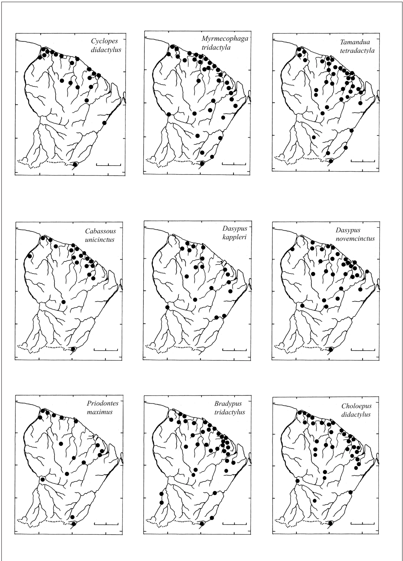
FIGURE 3. Maps of French Guiana with localities of observations for nine species of Xenarthra. The capture data from Petit-Saut have been allocated to a single locality, but they derive from a ca. 125 km 2 area along the Sinnamary catchment (as explained in Vié, 1999: pp. 120–122). The scale bar on the bottom right of each map represents 80 km. See text for further details.