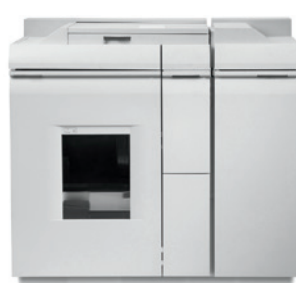
Basic Finisher Module Plus—Bypass