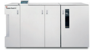
GBC® FusionPunch® II

The GBC FusionPunch II prepares documents for coil binding by punching and stacking a wide range of stocks with the speed, quality and reliability you need for high-volume production. This inline punch solution features an outstanding paper handling system that maximizes uptime and reduces skewing with remarkably consistent registration. It even handles challenging jobs with intermixed stocks, index tabs and lighter stocks that have traditionally been difficult to finish.