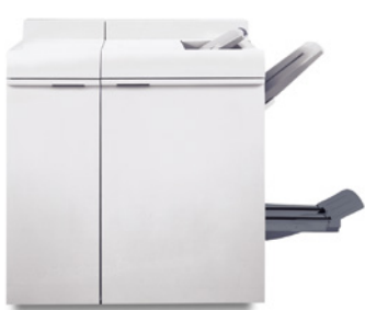
Multifunction Finisher Professional