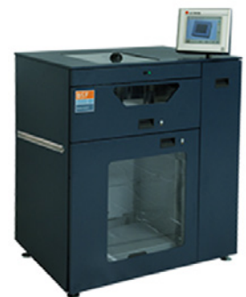
C.P. Bourg® Sheet Feeder (BSF)

The BSF includes two separate feeding compartments: a lower high-capacity tray that can accommodate pile heights up to 20" (508 mm) and an upper feed drawer that accommodates pile heights up to 6.3" (160 mm) of cover or insert sheets. When in bypass mode, the upper feed tray can be used as a covers feeder. A hand scanner is used to read JDF data from job-specific printed banner sheets that travel with the stacks. The BSF is equipped with OMR (optical mark recognition), double- and missed-sheet detection from both compartments and detects when either tray is empty.