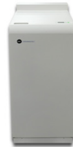
GBC® AdvancedPunch™ Pro

The GBC AdvancedPunch Pro lets you create professionally bound documents in-house by combining printing, punching and collating into one convenient step. Select from various interchangeable die sets for popular binding styles without manual punching, thereby increasing productivity and lowering costs while producing professional-looking documents.