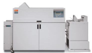
C.P. Bourg® BDFNx Booklet Maker with Square Edge

This compact booklet maker combines three functions—stitch, fold and trim—in one self-contained finisher. Its fully automatic setup controls document size, stitch location, spacing of the folding rollers and adjustment of the trimmer for professional looking booklets. The BDFNx accepts multiple types of paper stocks, including coated. It runs in two booklet modes: saddle stitch up to 22 sheets (80 gsm) or top stitch for corner-stitched books. Optional Square Edge (SQEDG) Module flattens the saddle-stitched spine for a perfect bound look, and runs at full production speed—great for those with full bleed applications.