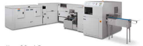
Xerox® Book Factory

Produce finished books with ease, speed and flexibility on the Xerox Nuvera® equipped with the Xerox® Book Factory. Together they provide the perfect inline solution for producing trade and reference books, catalogs, out-of-print and vanity books and more. With its document finishing architecture, cut sheets are moved directly onto an output transport conveyor, inline to the Xerox® Book Factory where they are perforated, rotated, folded and nested into signature book blocks. They are automatically sent to the binder where the spine is scored and synthetic hot glue is applied before a cover is added for a final perfect bind. The book then automatically travels through a three-sided trimmer where the finishing touches are added. (The CMT 330 three-sided trimmer is an optional module.) Produced at the rated speed of the Xerox Nuvera® Perfecting Production System, your books will be ready for immediate delivery.