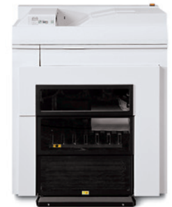
Xerox® Production Stacker

Adding to the Xerox reputation for world-class productivity, the Xerox® Production Stacker delivers up to 2,850 sheets at adjustable heights and even waits for an operator to unload it while it continues to print and stack another 2,850 sheets (maximum capacity of 5,700 sheets). This virtually eliminates time-consuming and costly starts and stops so jobs keep moving quickly and efficiently. The Xerox® Production Stacker is set to create a new standard for productivity and cost effectiveness in transactional print shops as it delivers all of the features of a digital production stacker within a smaller footprint.