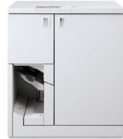
Xerox® Tape Binder

For easily creating professional-looking documents, Xerox Nuvera® Production and Perfecting Production Systems with Xerox® Tape Binder deliver high speed and crisp image quality plus the value and convenience of inline thermal tape binding. Operation is easy, with controls designed to allow you to define job settings, view status and perform basic tasks right at the Tape Binder's Operator Control Panel. Changing binder tape is easy too, with convenient, easy-to-load cartridges. Now available in a dual Xerox® Tape Binder configuration for added productivity.