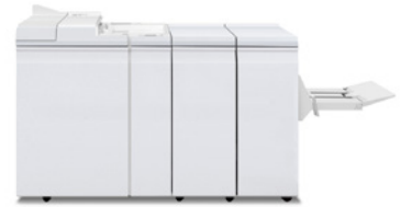
Plockmatic Pro50/35 Booklet Maker

To keep your booklet making jobs in-house, choose the Plockmatic Pro50/35 Booklet Maker, which offers an effective and productive booklet making solution. Designed to support production run lengths, it can fold 1 to 50 sheets (35 with Pro35) or saddle stitch and fold 2 to 50 sheets (35 with Pro35) for booklets up to 200 pages (140 with Pro35). The Plockmatic Pro50/35 Booklet Maker system is a modular solution that consists of a booklet maker, face trimmer, square fold unit and cover feeder. The optional square fold module creates a neat square-edged spine that is a perfect complement to any booklet. The RCT Rotate Crease Trimmer enables three-sided trimming of full bleed saddle stitched booklets. The Cover Feeder makes it possible to add pre-printed color covers (140 lb Index/250 gsm).