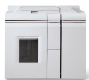
Basic Finisher Module—Direct Connect (BFM-DC)