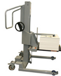
Production Media Cart