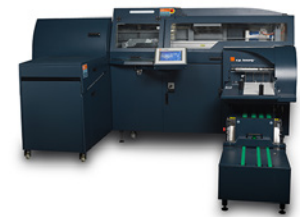
C.P. Bourg® 3202 Perfect Binder

The BB3202 can also make 13 positive or negative high-quality creases utilizing a knife-creasing technology that offers superior results and greater flexibility compared to conventional wheel-scoring, including the ability to create winged book jackets.