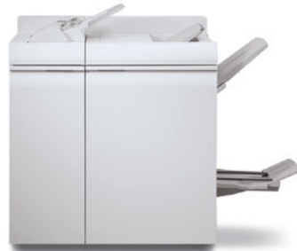
Multifunction Finisher Pro Plus