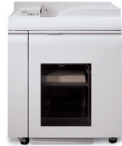
Xerox® DS3500 Stacker

Gain the utmost productivity with the Xerox® DS3500 Stacker. It enables your Xerox Nuvera® system to run continuously, even during unloading; simply unload one finisher while a second finisher collects your prints—nonstop. With a capacity to hold 3,500 sheets, this finishing device can stack your documents or pass them to any of the inline finishers available in the Xerox Nuvera® Production Systems' finishing portfolio.