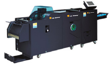
C.P. Bourg® BM-e Booklet Maker

The new generation inline Bourg Booklet Maker Enhanced (BM-e) is the first high-end, award-winning booklet maker that utilizes the latest technology to generate unparalleled quality booklets up to 120 pages, 30 sheets (75 gsm). Sheet sizes from 5.8" x 8" to 12.6" x 19.3" (147 mm x 203 mm to 320 mm x 490 mm) and A4 (letter) landscape booklets can be processed through the BM-e with ease. Through this solution, sheets will follow an automated bleed, crease, stitch, fold, trim process to create booklets. The BM-e accepts coated or uncoated 60 to 350 gsm paper.