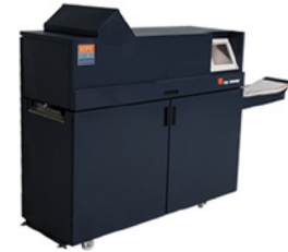
C.P. Bourg® BDF-e

The BDF-e can top or corner stitch from 2 to 50 sheets and it can also be used in the fold-only mode. The BDF-e is touchscreen controlled and requires absolutely no tools for changeover in sheet size or application. A complete paper path sensing system ensures that document production is monitored throughout each step of the process. It includes an easy load, self-threading wire stitching cassette that automatically produces over 50,000 stitches and even adjusts for various book thicknesses. Other features include a dual roller folder that ensures sharp, square, accurate folds and automatic sizing that utilizes a self-sharpening two-blade trimmer.