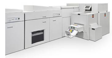
Watkiss PowerSquare™ 224

A complete book making system, the Watkiss PowerSquare 224 combines the four processes required to produce quality manuals: stitching, folding, spine forming and trimming. This finisher produces Watkiss SquareBack™ books up to 1"/10.4 mm (224 pages/56 sheets at 70 gsm). It features fully automatic settings and includes a six-position single stitch head that allows for a variable stitch leg length to accommodate for varying book thicknesses. A cost-effective alternative to perfect binding or tape binding, the Watkiss PowerSquare 224 will automatically adjust itself based on sheet count to provide the most accurate stitch length and fold depth—on the fly—to easily accommodate a variety of jobs.