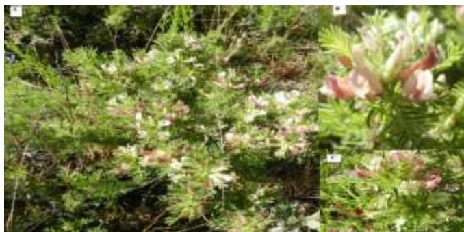
Fig 1. Astragalus oihorensis Ali A. Habit and Habitat; B. Flowering shoot C. Calyx with black hairs.