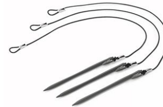
11-43912-03R 11-43912-50R Replacement stylus for brick configurations