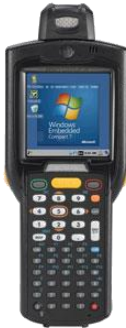
Microsoft Windows Embedded Compact 7.0