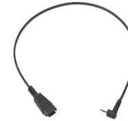
25-124389-01R Headset adapter