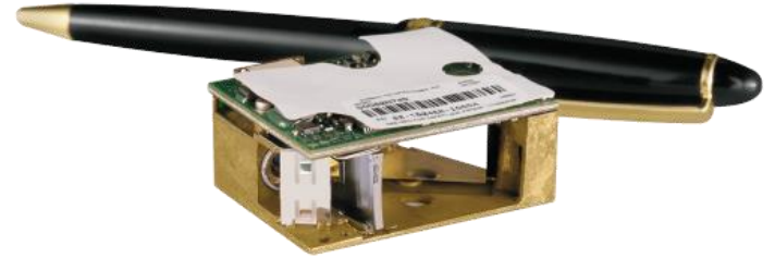
SE965 1D Standard Range Scan Engine

SE4750 1D/2D Standard Range Array Imager