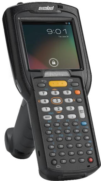
Android 4.1 Jelly Bean