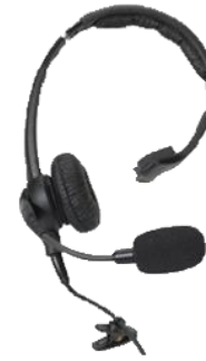
RCH51 Rugged Wired Headset