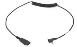
25-124411-03R Headset adapter cable