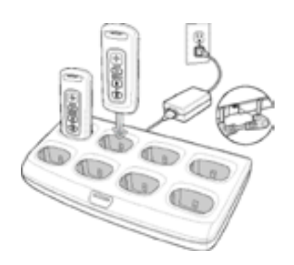
8-Slot Device Charger Charges eight devices simultaneously