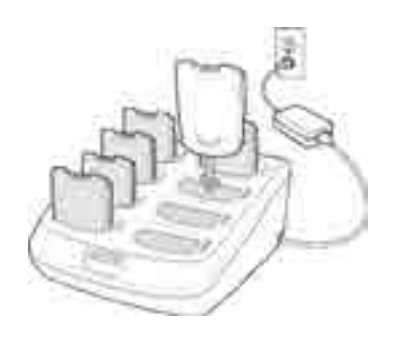
8-Slot Battery Charger Charges eight batteries simultaneously