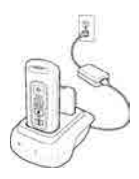
1-Slot Cradle Charges device and spare battery