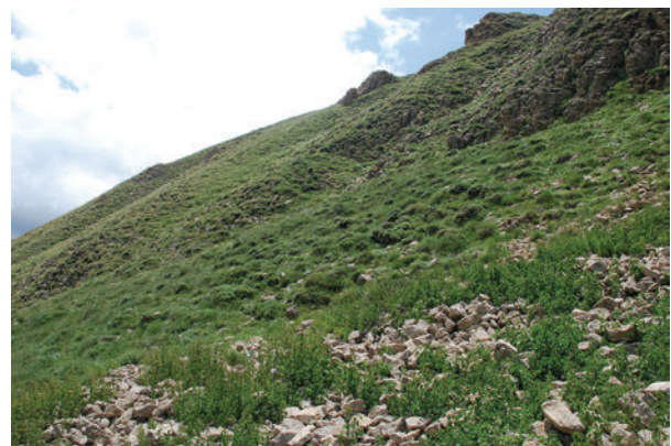
Fig. 10. Habitats of Pelias sakoi sp. nov. represented by mountainous xerophyte vegetation types like phrygana with tragacanth astragals.