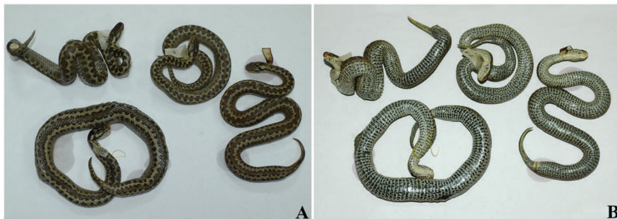
Fig. 12. Part of the type series of Pelias darevskii uzumorum ssp. nov. (SNP): A – view from above; B – view from below.

The main background is dark grey in adult males, and reddish-brown, smoky in females. Zigzag of females is wider, almost continuous, undulating, painted in dark-brown or red-brown; males zigzag is jerky black. Zigzag is connected or separated from a picture of the head. Young and semiadult specimens have zigzag wavy, relatively wide (Fig. 13F). In coloring of the pileus, there are light and dark grey tones in males and brown tones in females; brighter picture is evident in males. On the sides of the trunk in young and adults, there are stains, often blending in continuous lateral stripes,