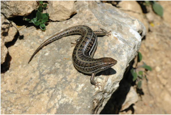
Fig. 20. Xerophilous relict Heremites vittatus (Oliver, 1804), the Ridge Otlubekli Dağları.