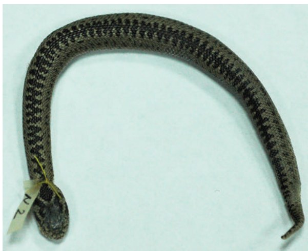
Fig. 7. The young specimen of Pelias sakoi sp. nov. (paratype: SNP 906).

the loreal shield; 20.8% females have a contact of the preocular shield with the nasal shield.