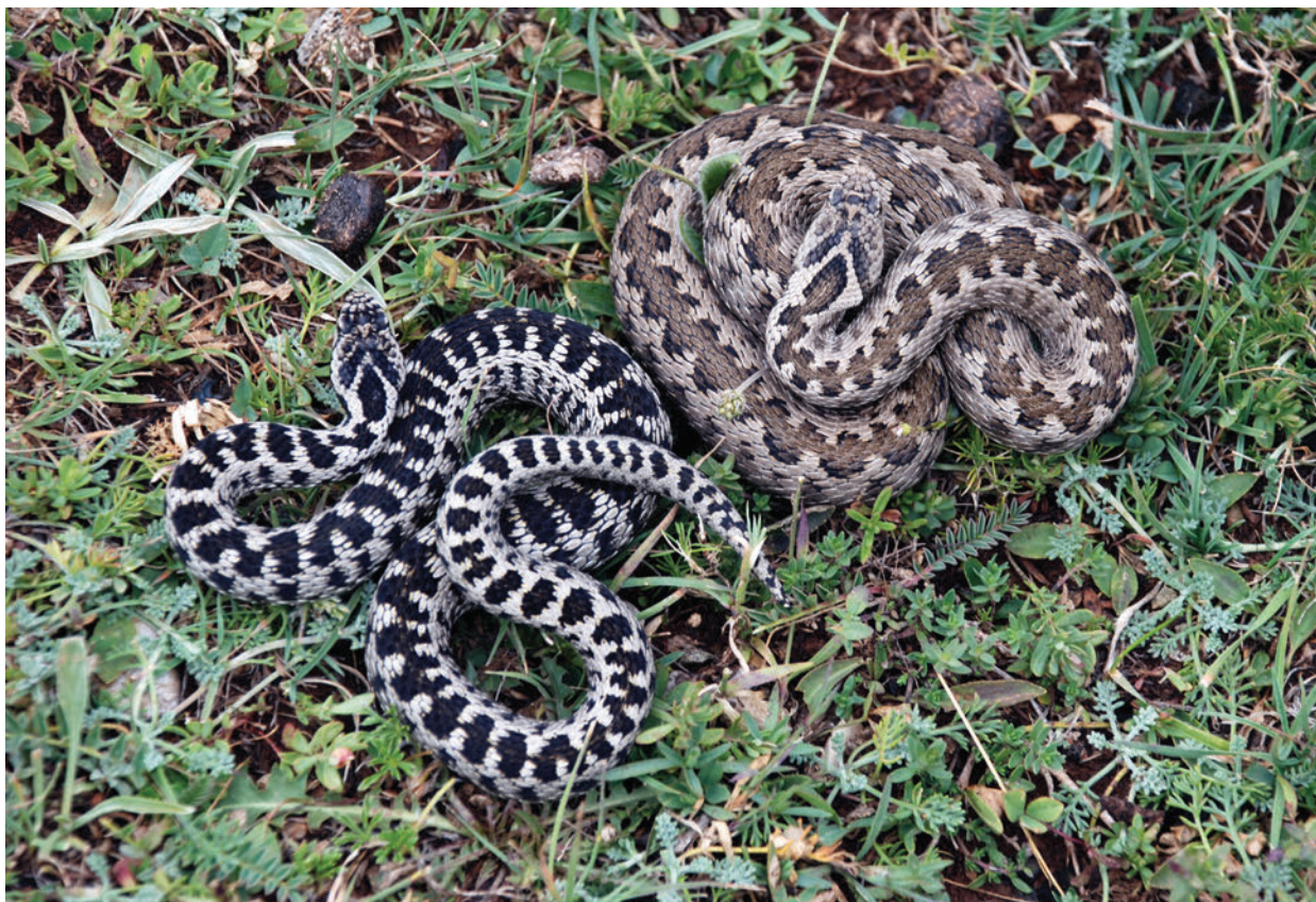
Fig. 4. Dorsal coloration of Pelias sakoi sp. nov.: left – male (holotype); right – female (paratype: SNP 906).

forming two general clades: the earliest division happened between P. eriwanensis and all other forms with the subsequent division into five separate clades (Fig. 2A, B). The minimum distance is marked between clades of vipers from Ardahan pass and P. darevskii .