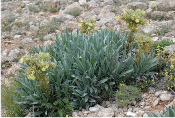
Fig. 19. East-Mediterranean xerophilous relict Arnebia densiflora (Nordm.) Ledeb., the Ridge Otlubekli Dağları.