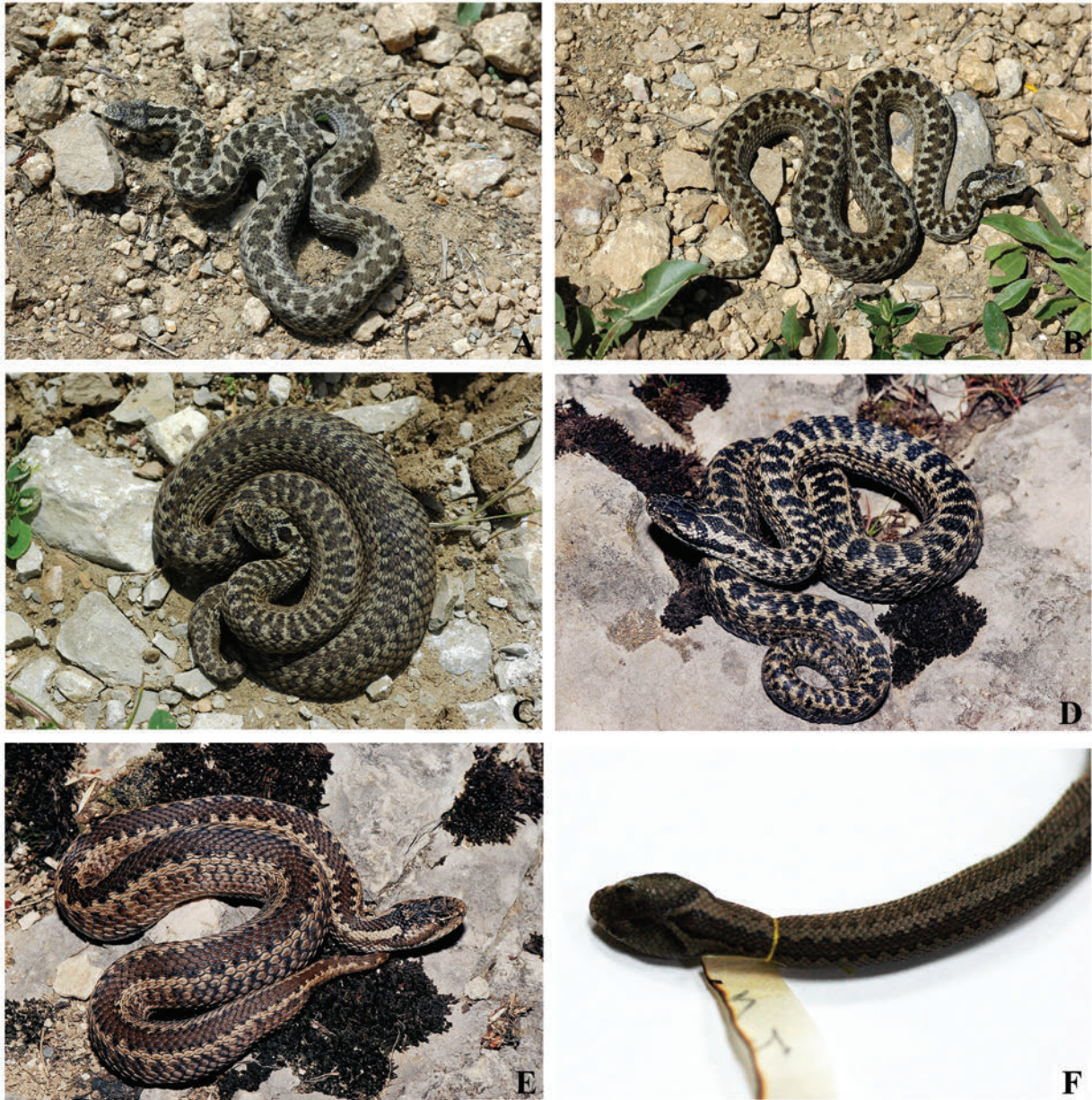
Fig. 13. Some of the paratypes of Pelias darevskii uzumorum ssp. nov.: A, B – SNP 909; C – ZDEU 99/2011; D – MNHN-RA-2002.410; E – BEV 8855; F – SNP 908.

brighter expressed in males. The throat of all specimens is light, the belly is dark-speckled in females to almost black in males; bottom of the tail in both sexes is not different in coloration from the belly, tail tip is bright yellow. In coloration of supralabials grey tones are present or not, dark stripe in the middle, or upper edge of the shields can be weakly present in both sexes.