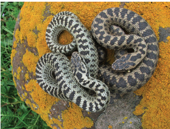
Fig. 21. The characteristic staining evenly back and sides of Pelias davevskii davevskii from the type locality: left – light grey male; right – brownish female.

bottom of the tail. There is a bright spot on the throat and individual bright scales at the end of tail.