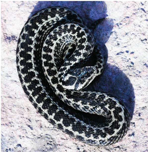
Fig. 16. Holotype of Pelias darevskii kumlutasi ssp. nov.

length – 20.6 mm, width – 12.7 mm, height – 6.9 mm, length of pileus (Pil.) – 12.6 mm; rostral index – 54.35. Number of preventrals – 2, ventrals – 134, subcaudals (S.c.) – 24, apicals – 2, number of crown shields (Cr) – 9, upper preocular shield separated from nasal by loreal (In.) in both sides; number of canthals – 6, rows of dorsal scales around the neck – 21, at mid-body – 21, and at posterior part of body – 17, supralabial shields on both sides – 9 (3 shields below eye, Supralab b.u. eye), sublabials on both sides – 10, shields around eyes – 9 on left and 10 on right, loreals – 4 on each side; the frontal and parietal shields are not divided; number of wings of zigzag – 176. Supralabials are light and covered by small grey dots in upper part. There are rather broad black stripes at sutures of shields in males. Color is light brown from above with a broad black zigzag consisting of transversely elongated spots, interrupted in anterior third, not connected with the drawing the head. The head is almost completely black. Lower side of the head and belly are black, not differ in coloration from the