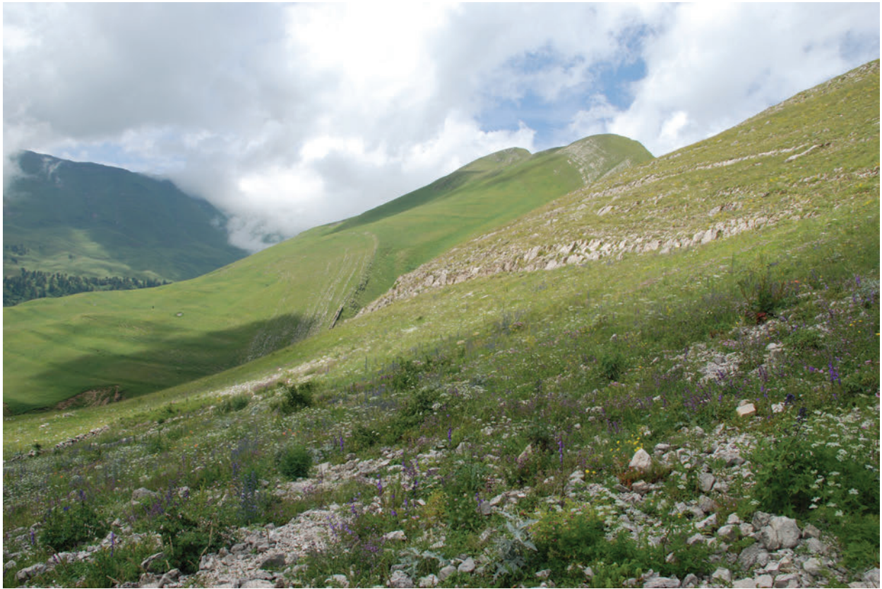
Fig. 15. Habitat of Pelias darevskii uzumorum ssp. nov. – subalpine hemixerophyt meadows.