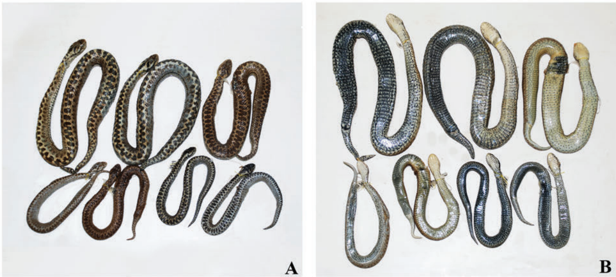
Fig. 17. Paratypes of Pelias darevskii kumlutasi ssp. nov., ZDEU 145/2001: A – view from above; B – view from below.