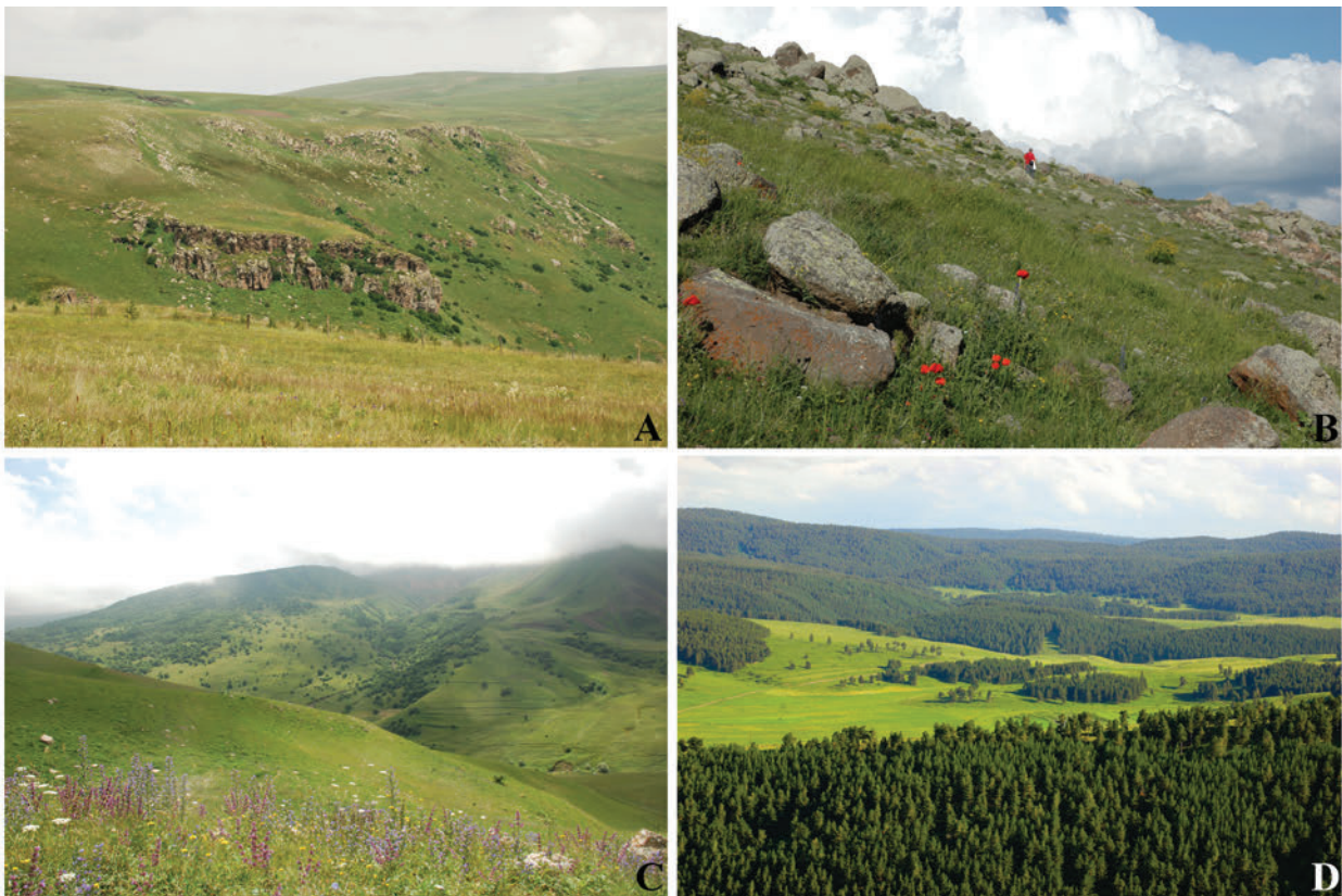
Fig. 18. A – Habitat of Pelias darevskii kumlutasi ssp. nov. at Ardahan pass, Turkey; B – Type locality of Pelias darevskii kumlutasi ssp. nov. – the Yalnızçam Dağları Ridge, vicinity of Bağdaşan Village, Ardahan, Turkey; C – Mezophilous relict broadleaf and dark-coniferous-broadleaf forests at southern part of the Yalnızçam Dağları Ridge in vicinity of Zekeriya Village; D – Xerophilous pine forests at northern part of the Yalnızçam Dağları Ridge in vicinity of Ardahan.