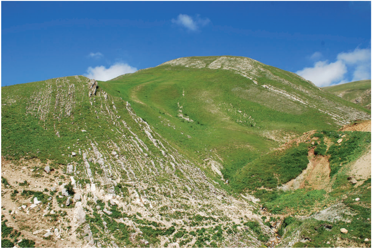
Fig. 14. Type locality of Pelias darevskii uzumorum ssp. nov. – vicinity of Zekeriya Village, Artvin, Turkey.

Biotopes of Pelias darevskii uzumorum ssp. nov. in vicinity of Zekeriya Village is represented by subalpine hemixerophyt meadows close on edaphically signs to meadow-like steppes with juniper lying shrubs ( Juniperus oblonga Bieb.) on limestones in altitudinal range 1990 – 2100 m a.s.l. Along all the habitats the stony areas, small talus, acanguares and rocky outputs of limestone are located (Geniez and Teynié 2005; Tuniyev et al. 2012) (Fig. 15).