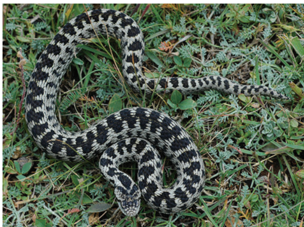
Fig. 6. Holotype of Pelias sakoi sp. nov.