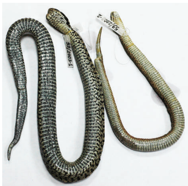
Fig. 5. Ventral coloration of paratypes of Pelias sakoi sp. nov.: left – male; right – female (paratypes: ZDEU 59/2003).

The results obtained confirm the high degree of morphological separation of the compared samples of vipers. Degree of likeness between the selected samples in a CDA estimated on the size of distance of Makhalonobis (Tyurin et al. 2003). The distances between the centers of samples of males of vipers varied from 18.3 to 90.1. Minimum value was shown between males of P. darevskii and vipers from Zekeriya (18.3) and between P. olguni and P. erivanensis (27.5); maximal (90.1) – between males from Erzincan and Zekeriya (Appendix: Table 20). For the females, this distance between the centers of samples varied from 7.8 to 20.6. Minimum (7.8) was recorded between the females of P. olguni and vipers from Ardahan pass and between the latter and Zekeriya (110.9); maximal (20.6, 18.8) – between females P. darevskii and P. olguni with females from Erzincan (Appendix: Table 21).