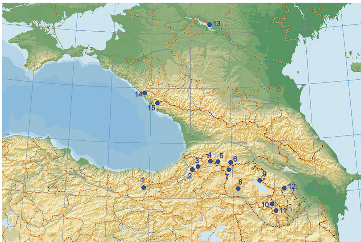
Fig. 1. Localities of collecting of tissues for DNA analyses: 1. Vicinity of Erzincan, Çilhoroz Village/Turkey. 2. Zekeriya Village/Artvin/Turkey. 3. Ardahan pass and Bağdaşan Village/Turkey. 4. Posof, Mt. Ilgar-Dağ/Turkey. 5. Mt. Gumbati/Georgia. 6. Mt. Madatapa/Georgia. 7. Mt. Sevsar, Vil. Saragjuh/Armenia. 8. Mount Araiiler/Armenia. 9. Sevan Lake, Vil. Drakhtik/Armenia. 10. Sisian/Armenia. 11. Vicinity of Vil. Verin Giratakh, Bargushat Ridge/Armenia. 12. Nagorno-Karabakh. 13. Lake Manych-Gudilo/Russia. 14. Settlement Bolshoy Kichmaj/Sochi/Russia. 15. Kamenny Klad Ridge/Abkhazia.

in specimens from Erzincan and Ardahan pass with P. darevskii (5.3) and minimal in P. eriwanensis (5.1).