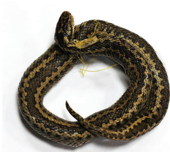
Fig. 11. Holotype of Pelias darevskii uzumorum ssp. nov.

Additional material. PGe 450-451, 453, 455-456, two adult males and three adult females; Turkey, Artvin Province, the Yalnızcım Dağları Ridge, vicinity of Zekeriya Village (2000 m above sea level), 24.07.2011, collectors A. Teynié and P. Geniez.