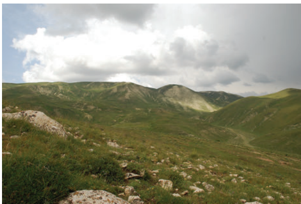
Fig. 9. Type locality of Pelias sakoi sp. nov. – near Çilhoroz Village, vicinity of Erzincan, Turkey.