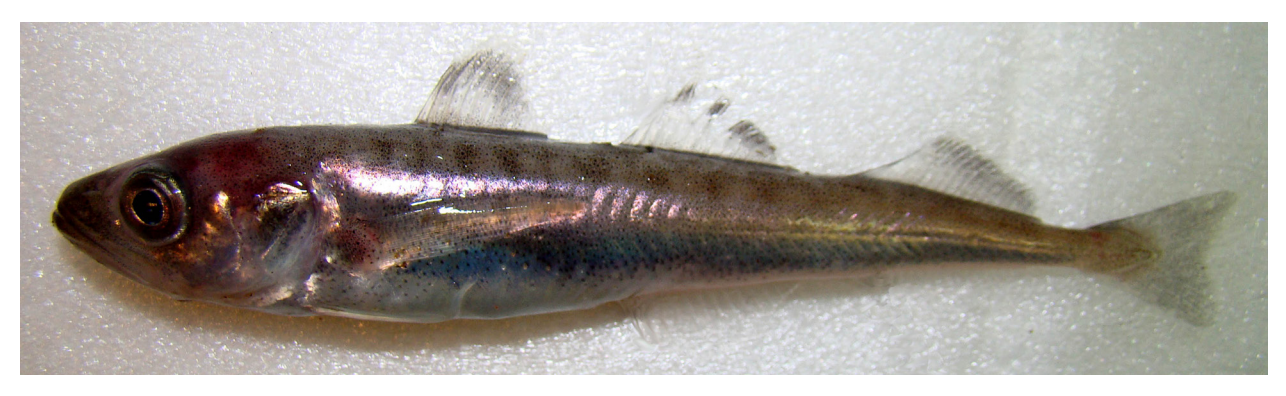
Fig. 5. Polar cod Boreogadus saida , "banded" form caught in the southwestern part of the Kara Sea (73°44.5 N, 70°31.8 E), depth 20.5 m; fresh specimen TL 115 mm.

that, under conditions of lower temperatures, their hatching could occur around the beginning of August. This corresponds to the period of sea ice melting in the waters of the archipelago (July–August). Other authors also suggest that the hatching coincides in time with the break-up and melting of the sea ice (Yudanov 1976; Ponomarenko 2000).