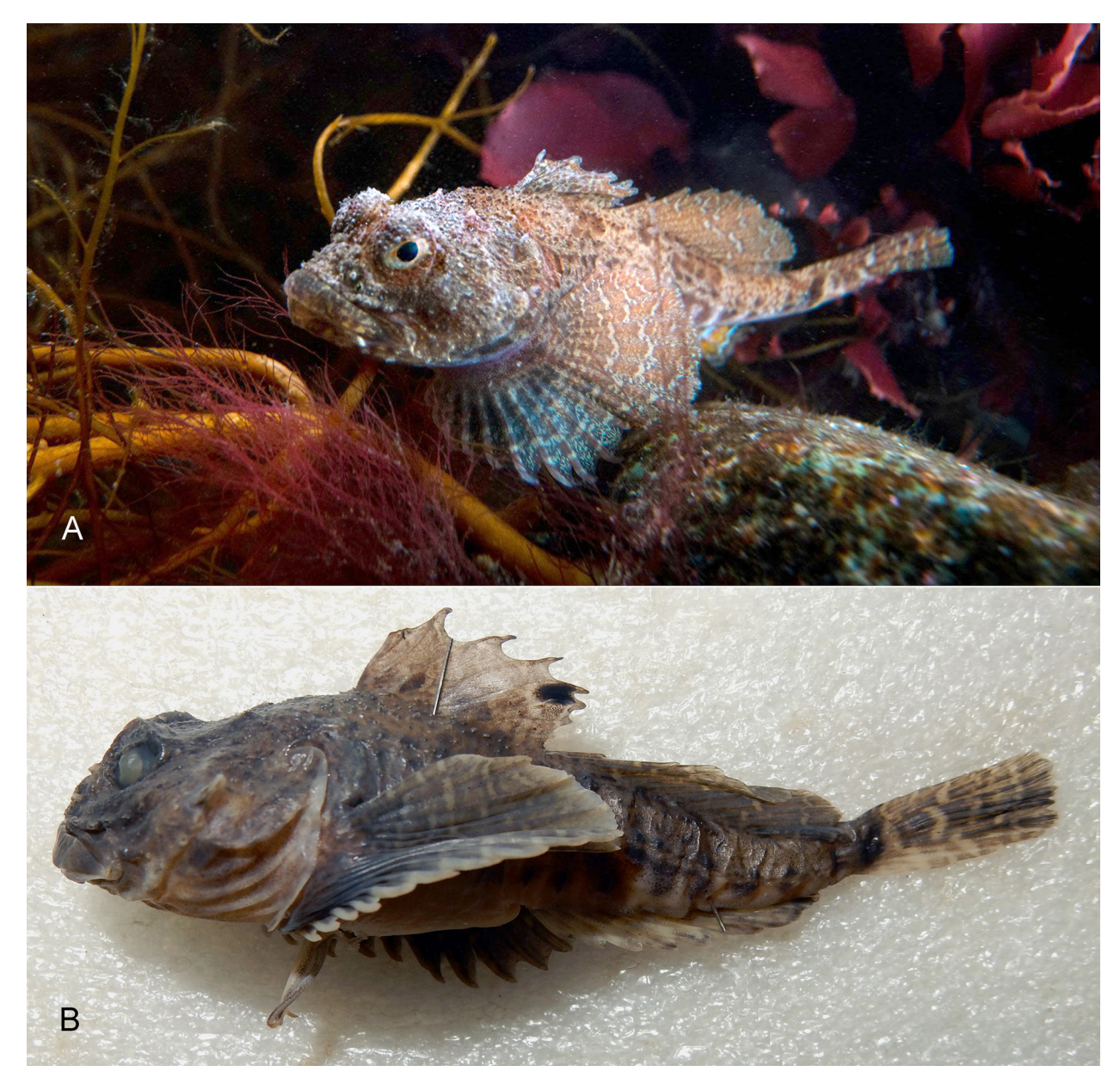
Fig. 6. Rough hookear sculpin Artediellus scaber, Bolshoy Island: A – in vivo; B – the same specimen (ZIN No. 56682, TL 73 mm).

Questionable sculpin records. In the waters of the archipelago, the fourhorn sculpin Myoxocephalus quadricornis (Linnaeus, 1758) was noted; several specimens were caught in September 1932 by a dredge near the coast of Domashniy I. (Burmakin 1957). However, the ZIN collections do not contain a single specimen of this species from the area of Severnaya Zemlya, as well as from offshore. All ZIN specimens from the Kara and Laptev seas had been