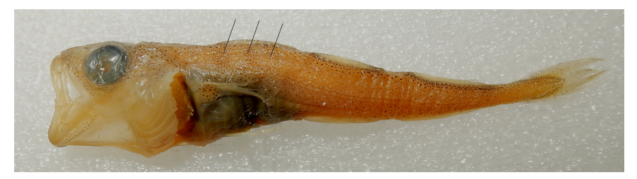
Fig. 4. Polar cod Boreogadus saida , "banded" form (designated by lines) caught to the northeast of Severnaya Zemlya (ZIN No. 56683, SL 59 mm).