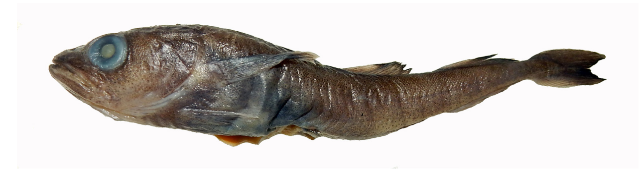
Fig. 3. Polar cod Boreogadus saida, "black" form, Mikoyan Bay of the Bolshevik Island (ZIN No. 56684, TL 141 mm, SL 127 mm).

SL 127 mm (Fig. 3) with gonads at maturity stage IV (ZIN No. 56684). Since the specimen was dropped by a seabird, it appears to have been caught in surface waters around the archipelago.