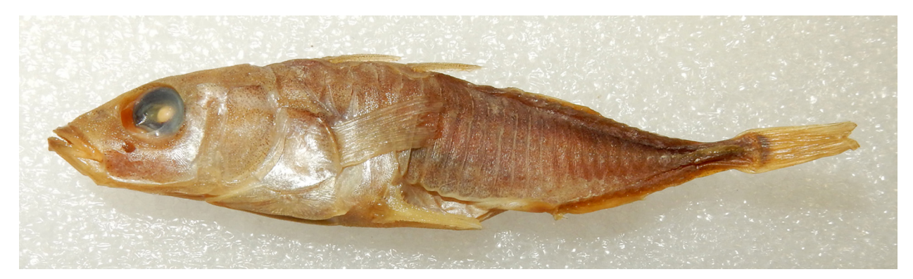
Fig. 9. Three-spined stickleback Gasterosteus aculeatus, October Revolution Island (ZIN No. 48974, TL 66 mm).

12(6/6) on hypurals, 7 upper and 6 lower short unbranched rays. Lateral plates on body 30, the last 4 of them form a lateral keel on the caudal peduncle.