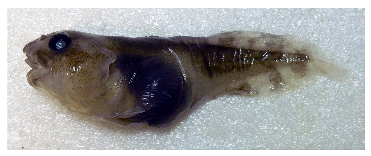
Fig. 7. Black-bellied snailfish Liparis cf. fabricii, Bolshevik Island (ZIN No. 56679, TL 102 mm).

waters of Severnaya Zemlya since it is often found in the shallows of another high-latitude archipelago, Franz Josef Land (Chernova et al 2014).