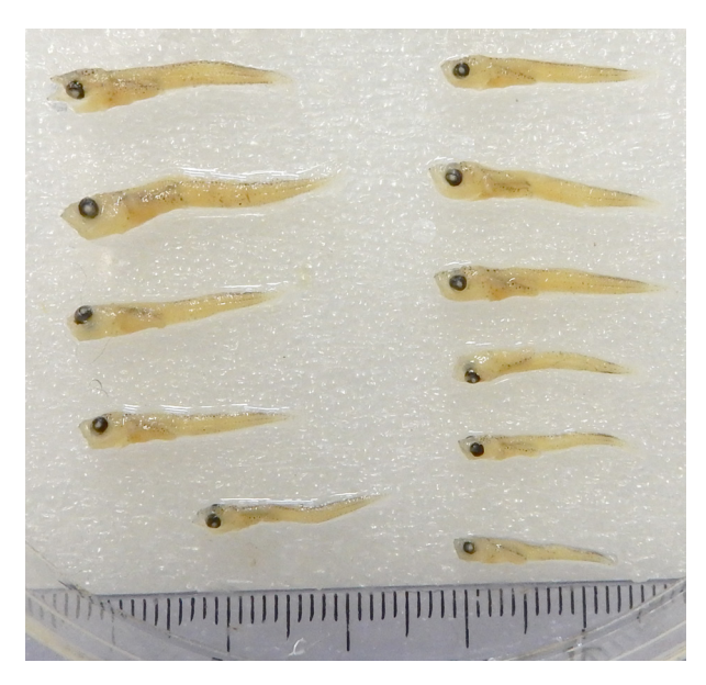
Fig. 2. Larvae of polar cod Boreogadus saida , TL 15.0–23.5 mm, Severnaya Zemlya, Mikoyan Bay.

In late August – early September, in Mikoyan Bay (the north of the Bolshevik I., 79°13.80'N 102°15.60'E), mass accumulation of polar cod larvae was observed. According to the expedition participants, when crossing the bay in a rubber boat, the water was teeming with larvae. The larvae were so abundant that it was possible to scoop them from the boat by an ordinary ring-net. Polar cod larvae caught in this way had a length TL of 15.0–23.5 (on average 19.5) mm. The larvae were likely not advected from the open sea, because the mouth of the bay and the outlet from it were closed by residual (winter) ice. And larvae cannot be drifted by deeper water currents into the bay, as both eggs and small larvae are