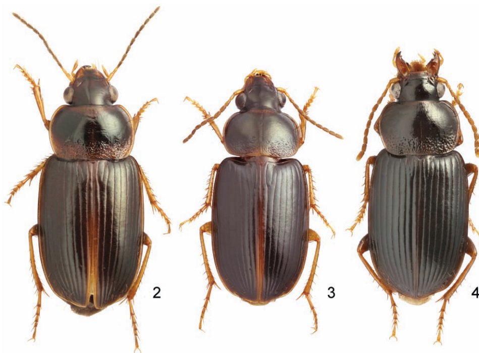
Figs 2–4. Stenolophus (subgenus Egadroma ), general appearance: 2, S. (E.) ovatulus (Vietnam); 3, S. (E.) melniki sp. nov. (holotype); 4, S. (E.) ovchinnikovi sp. nov. (holotype).