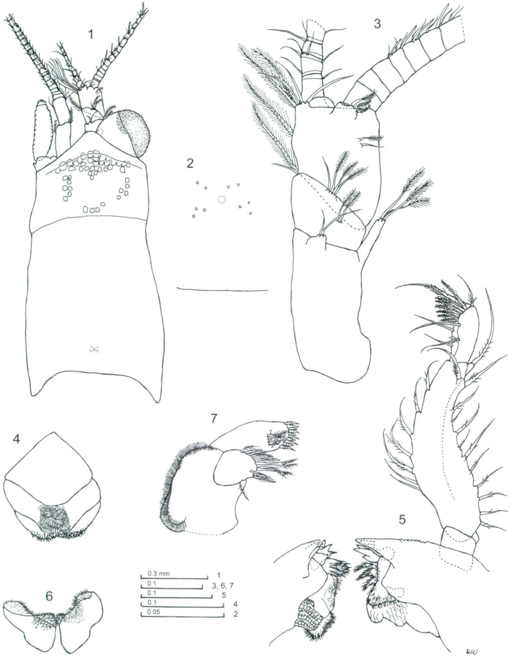
Figs. 1-7: Heteromysis arianii sp.n. (1: holotype ♂ 2.9 mm; 2, 5, 7: paratype ♂ 2.8 mm; 3, 4, 6: paratype, subadult ♀ 4.0 mm): (1) anterior body region of male, (2) pores in front of posterior margin of carapace, (3) right antennula of female, dorsal, (4) labrum, oblique ventral view, (5) mandibles with left palpus, caudal aspect, (6) labium, (7) maxillula, caudal aspect.