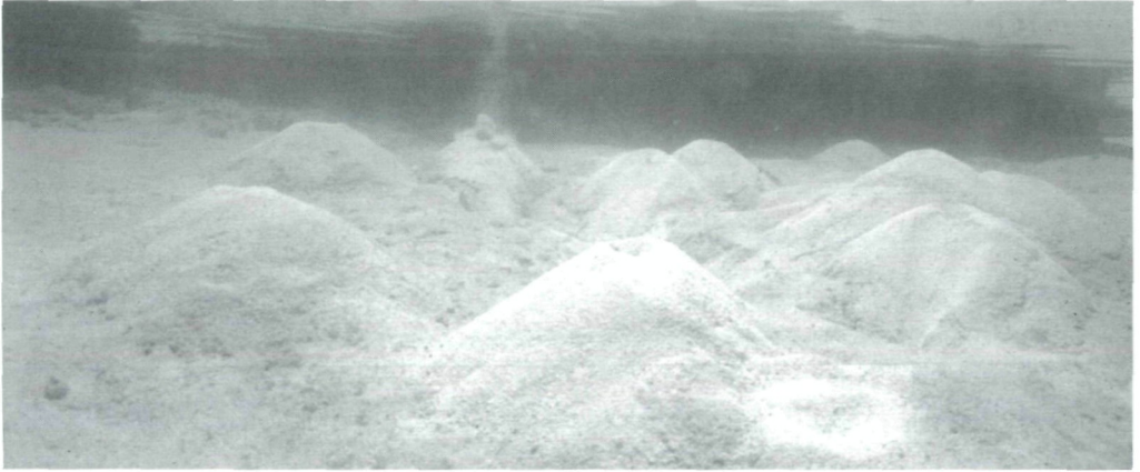
Fig. 1: Mounds and funnels produced by Neocallichirus rathbunae . Bermuda, Bethel's Island, Elys Harbor, 0.5 m water depth, August 1992. Distance across base is ca. 1.5 m.

Concurrently, Axiopsis serratifrons (A. MILNE-EDWARDS, 1873) a circumtropical axiid species dwelling in shallow subtidal sand bottoms with a high content of gravel and rocks (KENSLEY 1980, LEMAITRE & RAMOS 1992, SAKAI 1992, NOMURA & al. 1996), was collected there.