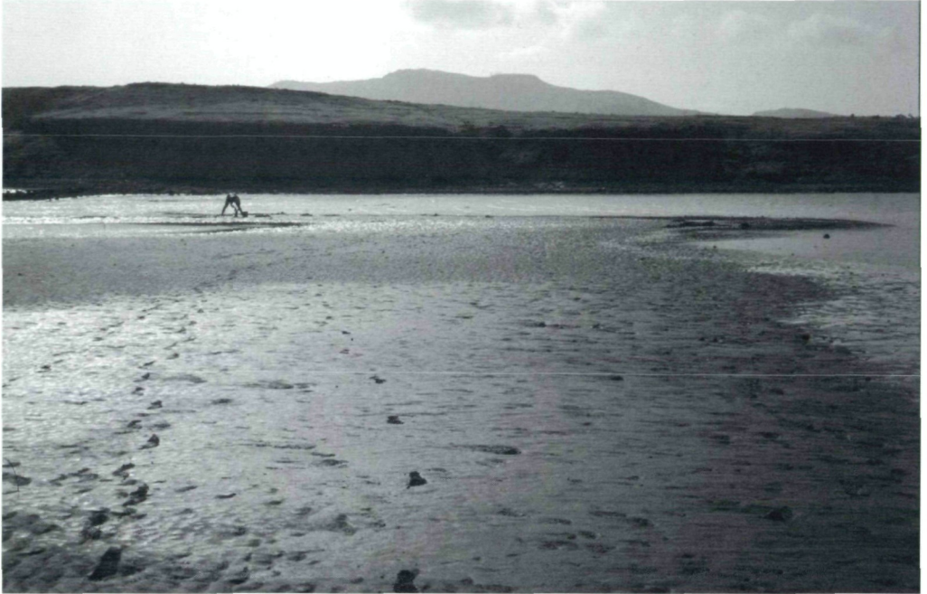
Fig. 2: Habitat of Corallianassa intesi . Cape Verde Island, Ilha do Sao Tiago, tidal flat at Moia-Moia at low tide, view to NW, October 1999.

On the Ilha da Boavista, Corallianassa intesi was caught on a beach on the northeastern coast of the Ilheu de Sal-Rei (16°10'00"N, 22°55'50"W). In 2 m depth the sediment consisted of medium fine carbonate sand and was interspersed with rubble originating from the coral heads nearby. In addition, Corallianassa intesi was observed 5 km offshore the northeastern coast of the Ilha da Boavista (16°10'00"N, 22°55'50"W) in 17 m depth and on the Ilha do Maio, 4.5 km offshore north of Punta Cais in 16 m depth. At these locations, the burrow openings were also round holes in the sand surface; the sediment was a medium carbonate sand between coral heads.