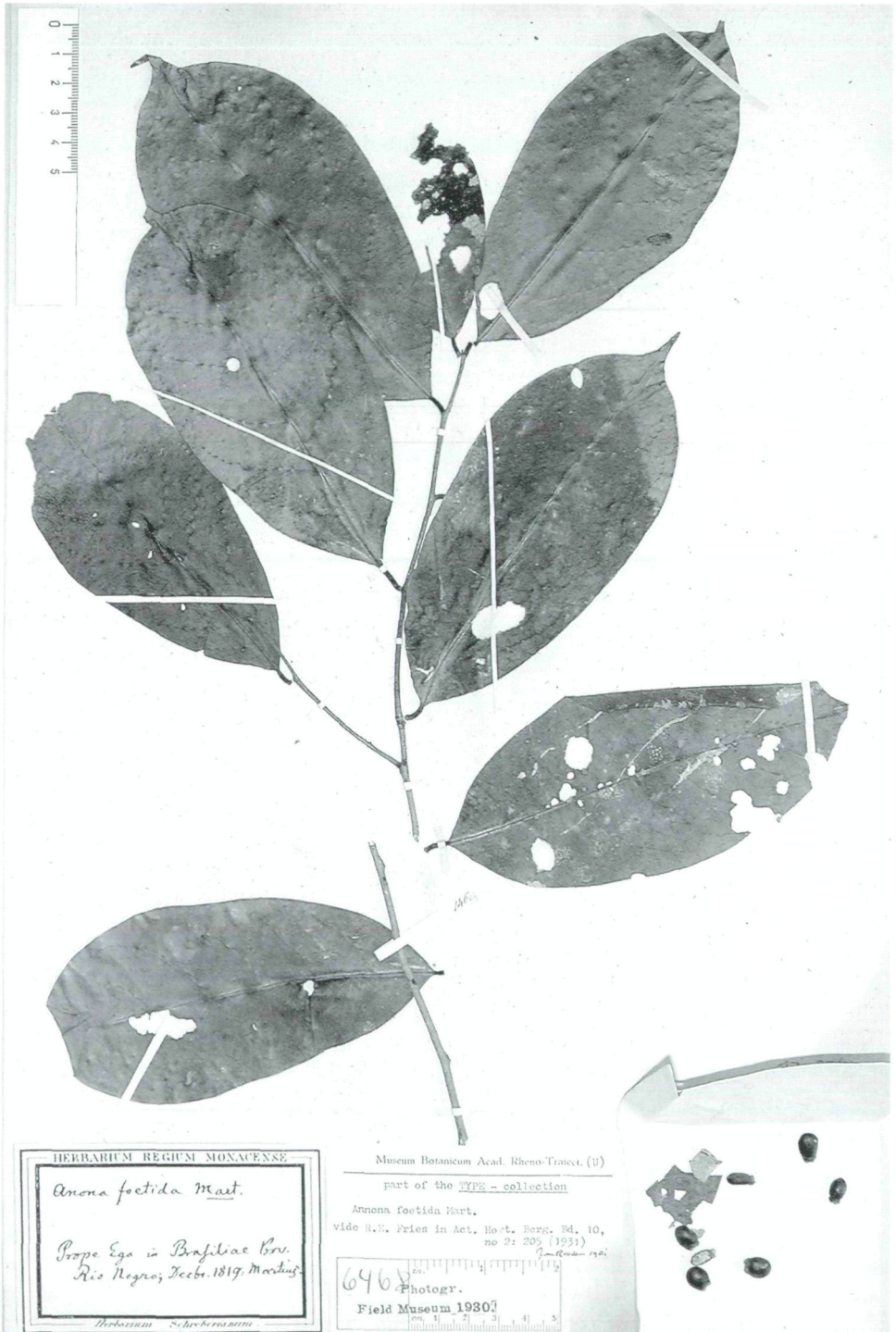
Fig. 3: Lectotype of Annona foetida MART. (C.F.P. von Martius s.n. [M])