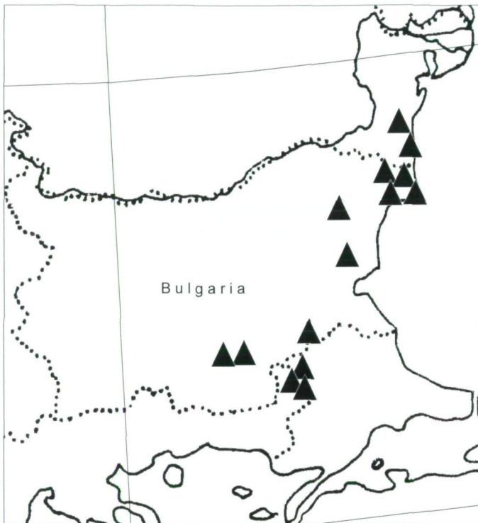
Fig. 2: Distribution of Erysimum bulgaricum .

In North-Eastern Bulgaria in a locality south of village of Bejanovo the species grows in plant communities of Festuca valesiaca and Paeonia tenuifolia together with Astragalus haarbachii , A. dasyanthus , Linum austriacum , Onosma thracica , Asyneuma anthericoides , Achillea collina , Hyacinthella leucophaea et al.