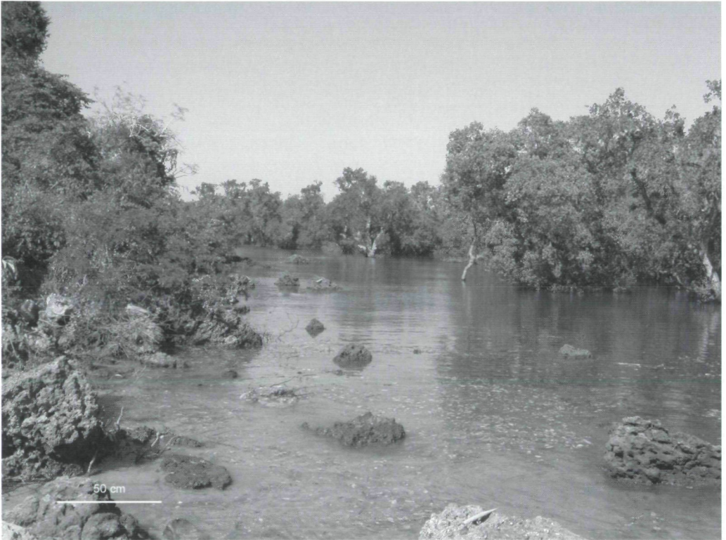
Fig. 1: Collection site at Ekas Bay, Lombok. The specimens can be observed and caught in the zone between mangrove forests and rocky coastline. In front, flotsam covers the water surface between the rocks. During low tide the collection site and the mangrove forest fall dry.

Rensch (in GRIMPE 1931) found his specimens directly in front of the mangrove forest in small pools with muddy sediment and amongst the mangrove roots ( Sonneratia sp.). We caught our specimens in an area between the mangrove forest ( Avicenna sp.) and the rocky coastline (Fig. 1). This small zone (width about 20 m, length about 50 m) is sandy and lacks vegetation. North and south of this area the beach is sandy. No individuals were detected between the mangrove roots or on the sandy bottom. The collection site and mangrove forest are submerged at high tide (to about 1.2 m high) and fall dry at low tide. During high tide, garbage, leaves and other plant material are transported here by the current. On some days this flotsam covers almost the whole water surface; this differs from all known habitat conditions of cephalopods and in particular of pygmy squids. Interestingly, I. pygmaeus was detected here, caught in high numbers within or below the flotsam.